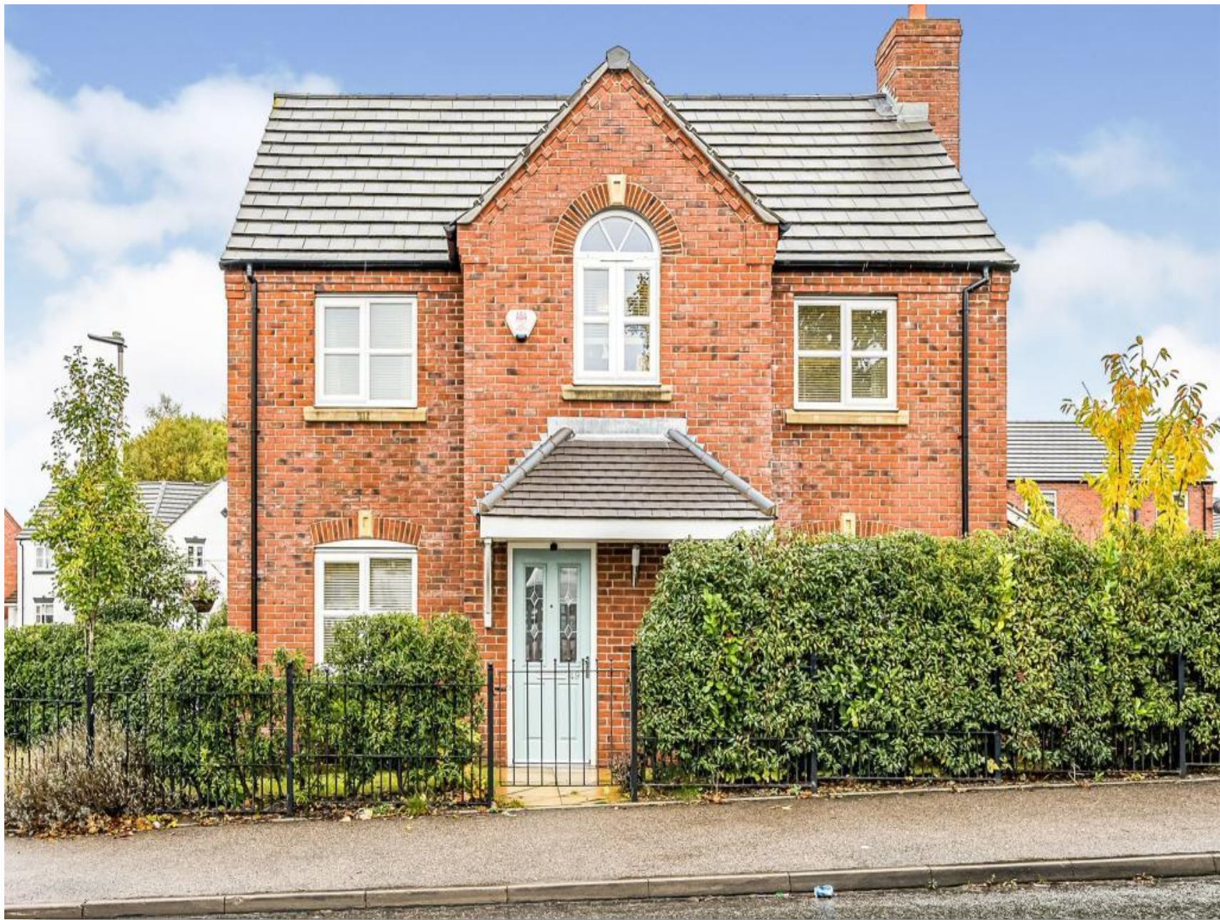
Lower Church Lane, Tipton DY4 7PG