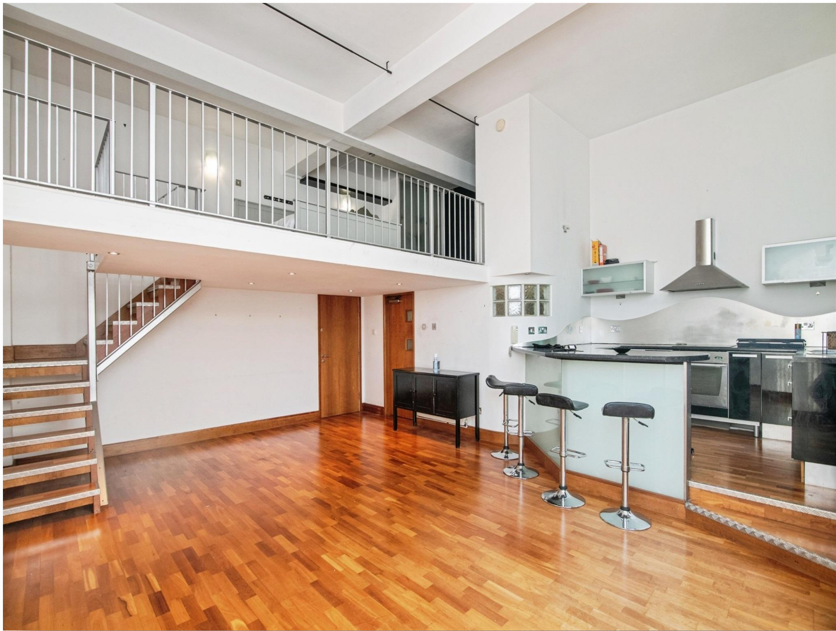
Metropolitan Lofts Parsons Street,Dudley DY1 1JE