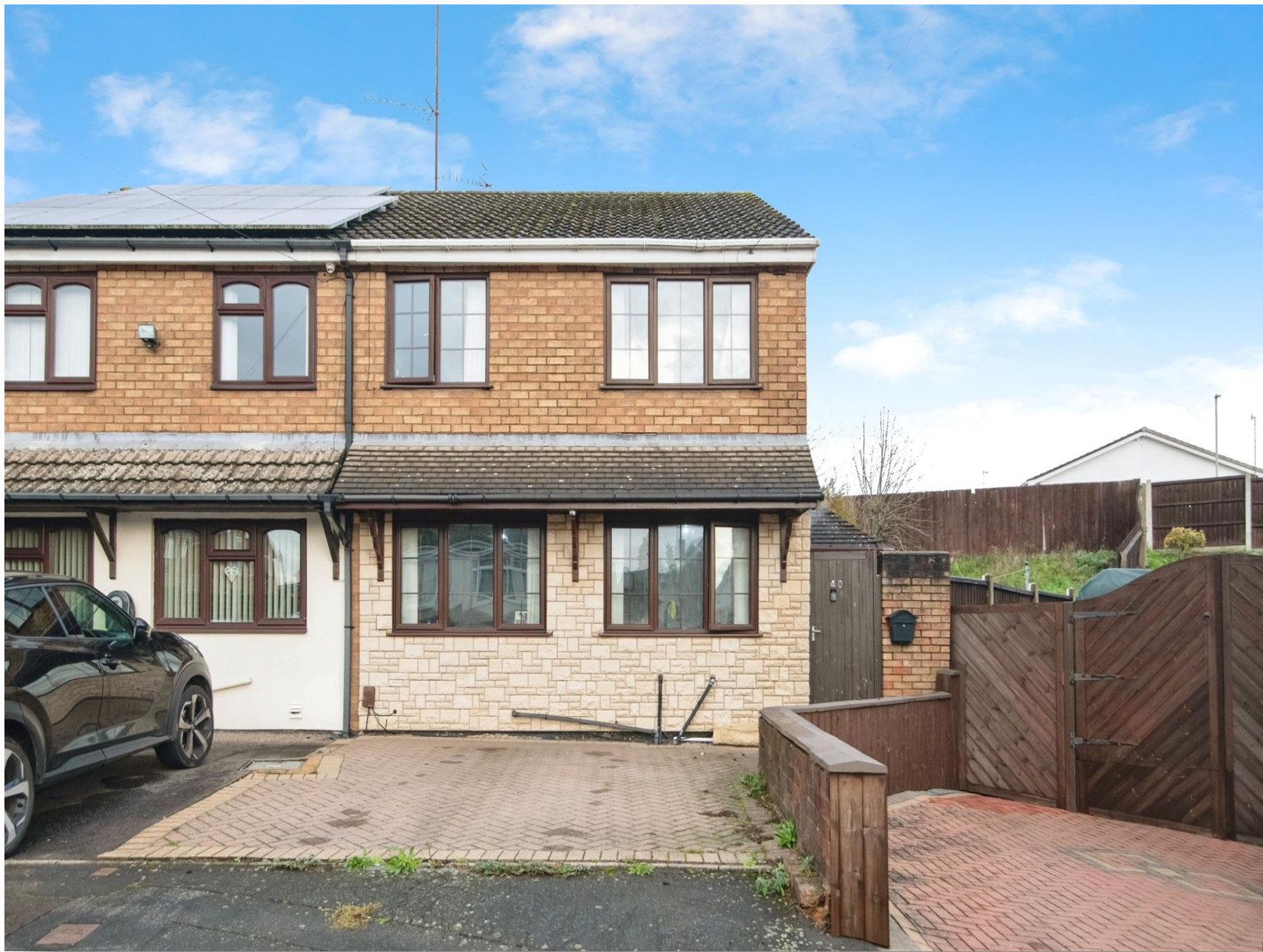
Hadley Close,DUDLEY DY2 9JX