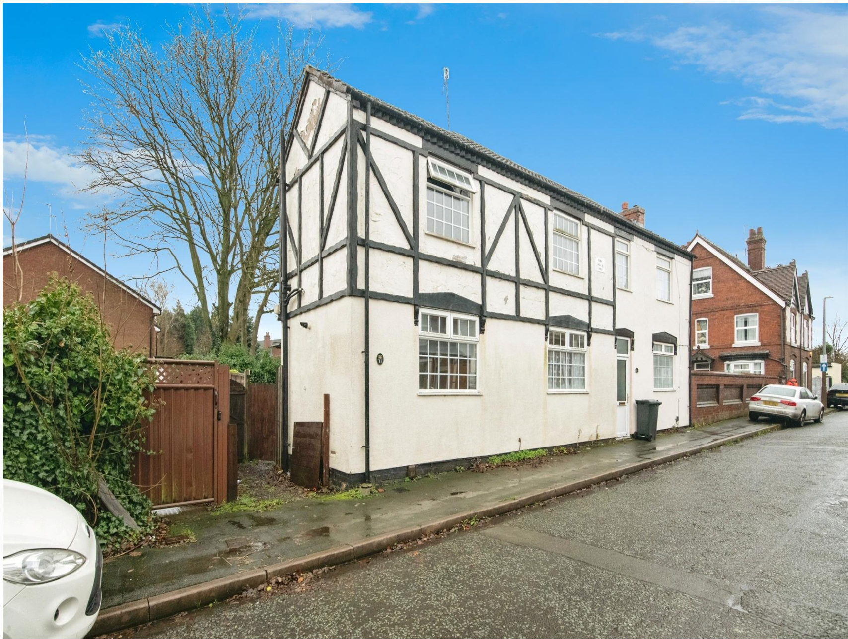
Victoria Street, Brierley Hill DY5 1RD