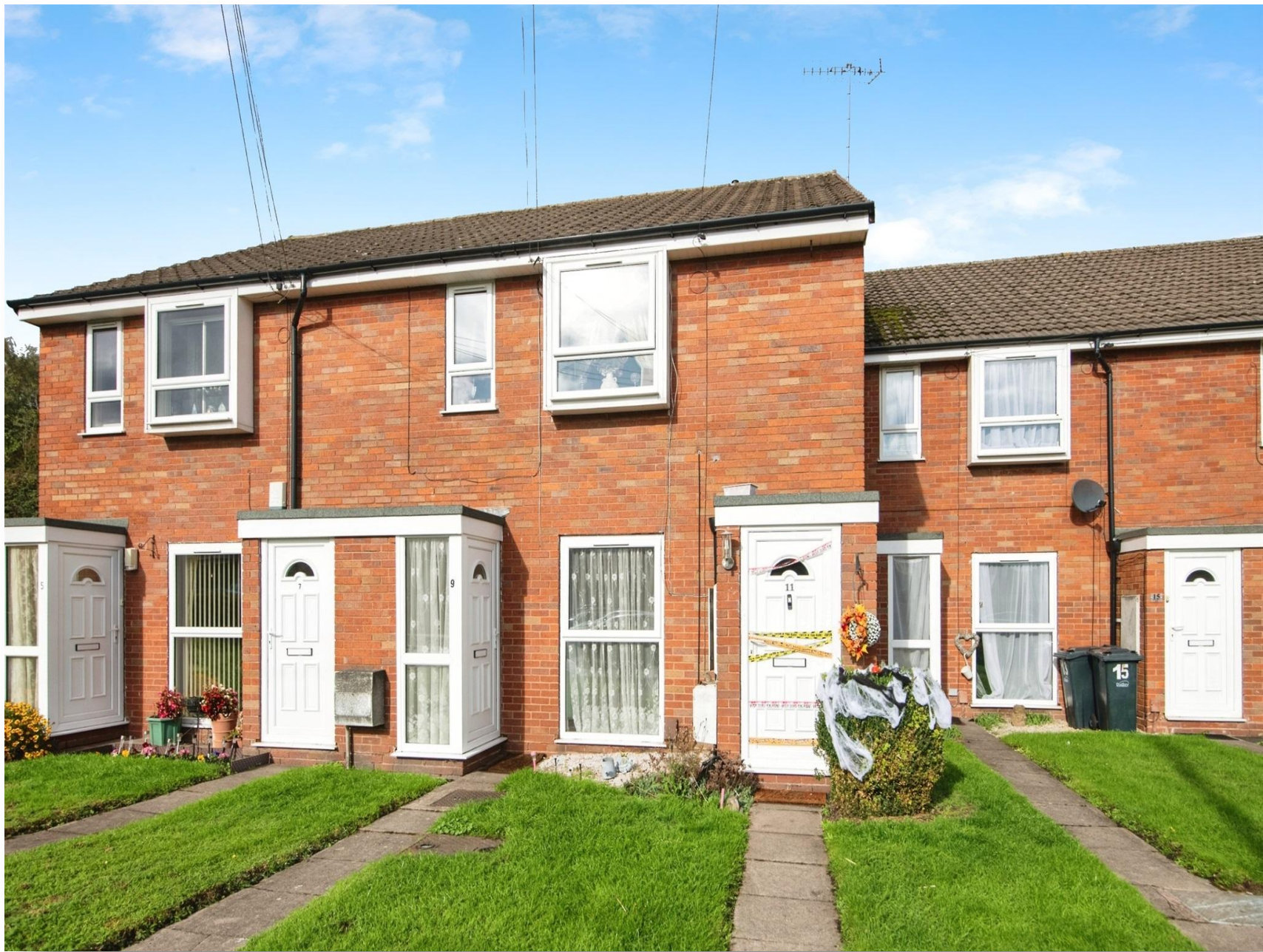
Windmill End,Dudley DY2 9HU