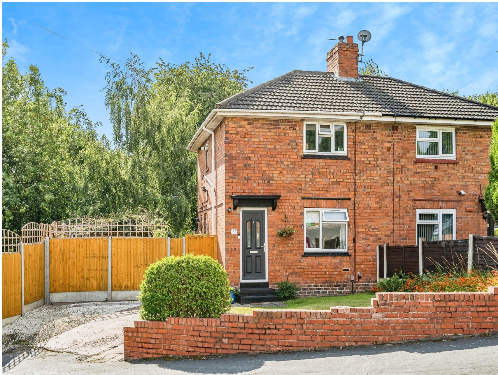
Wrens Hill Road,DUDLEY DY1 4EB