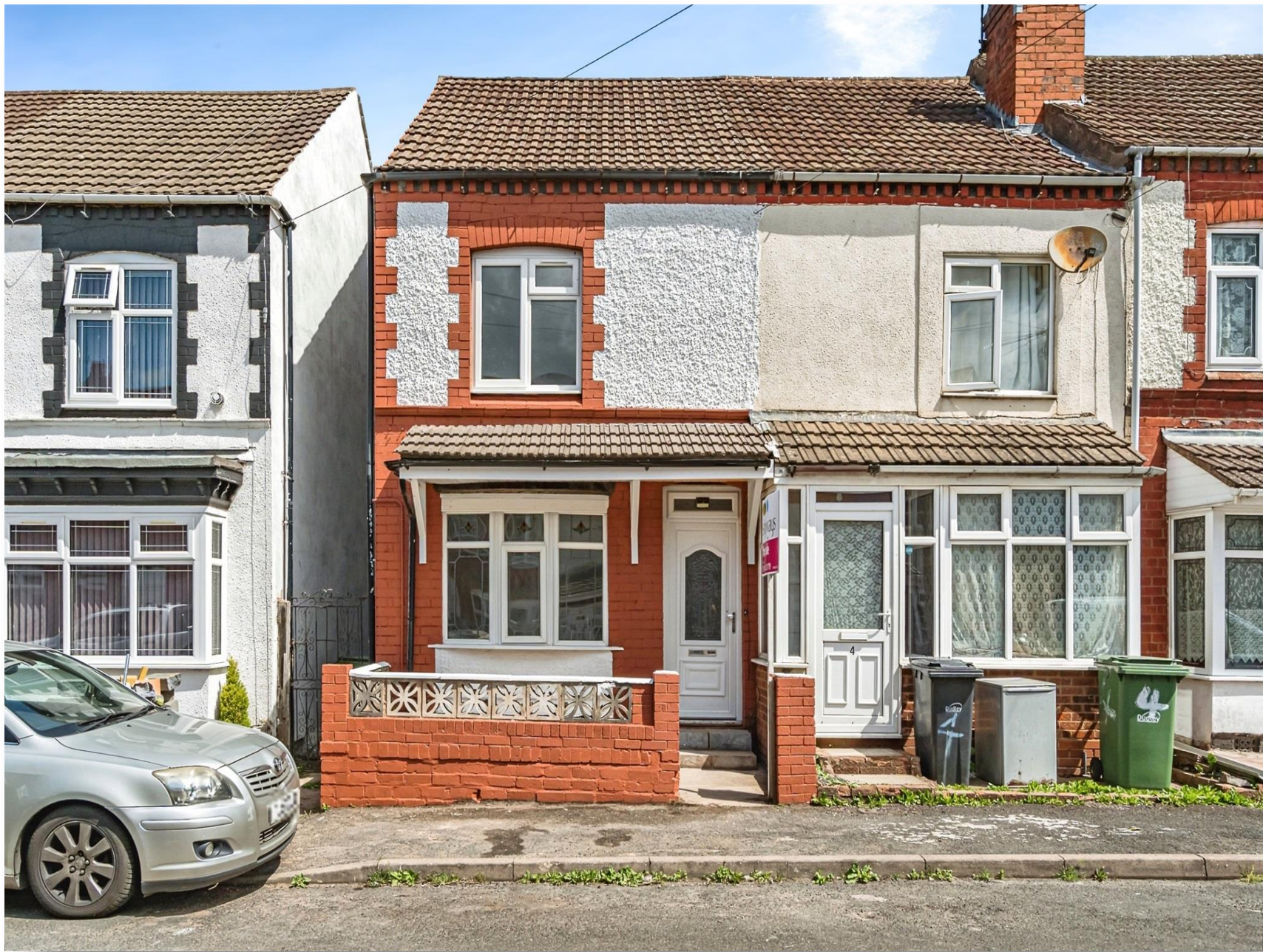
Gammage Street, Dudley DY2 8XL