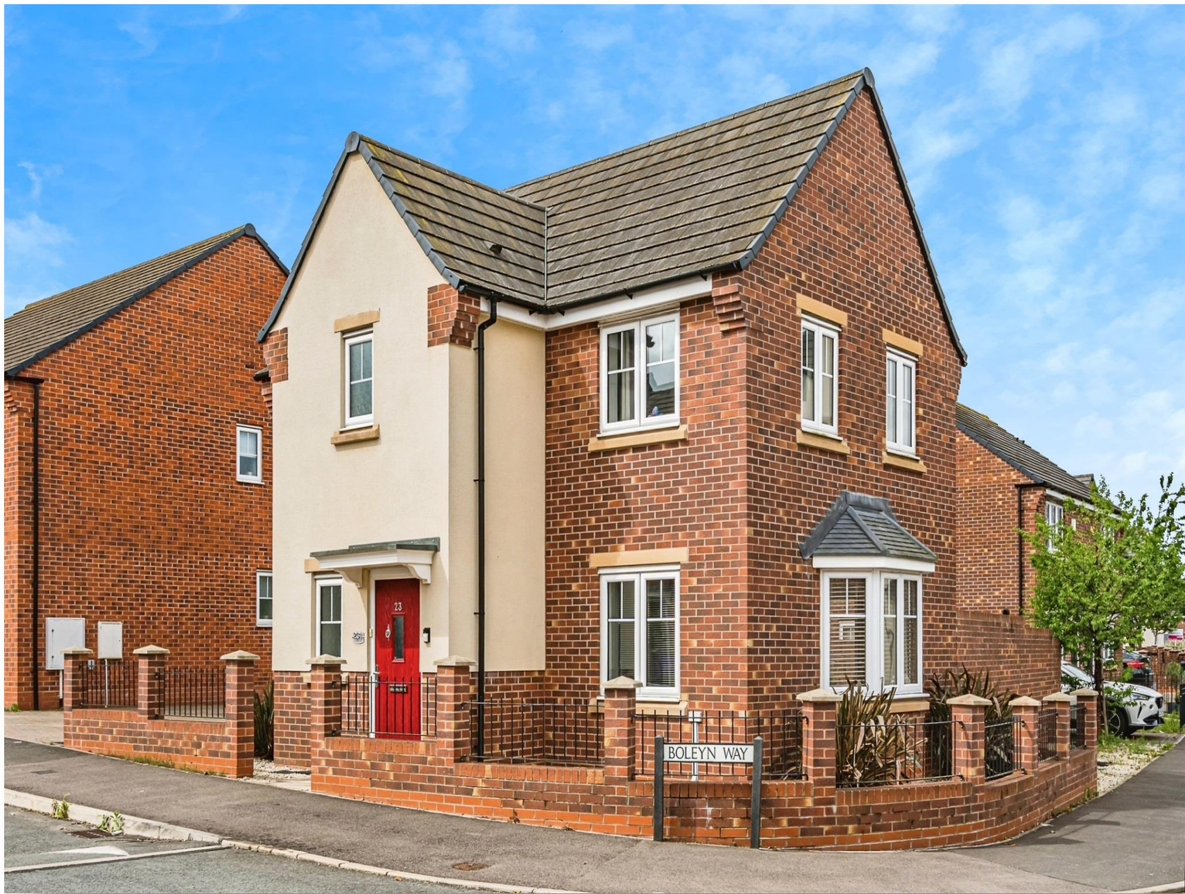
Boleyn Way, DUDLEY DY1 2PE