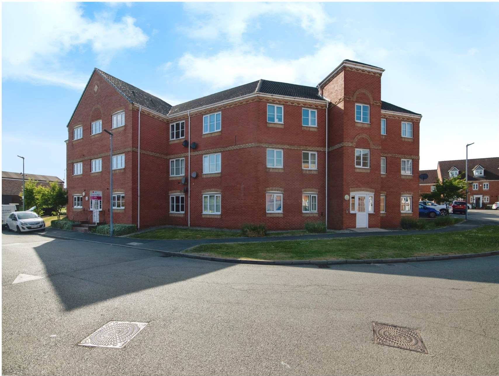
Bedford Street, Tipton DY4 7NX