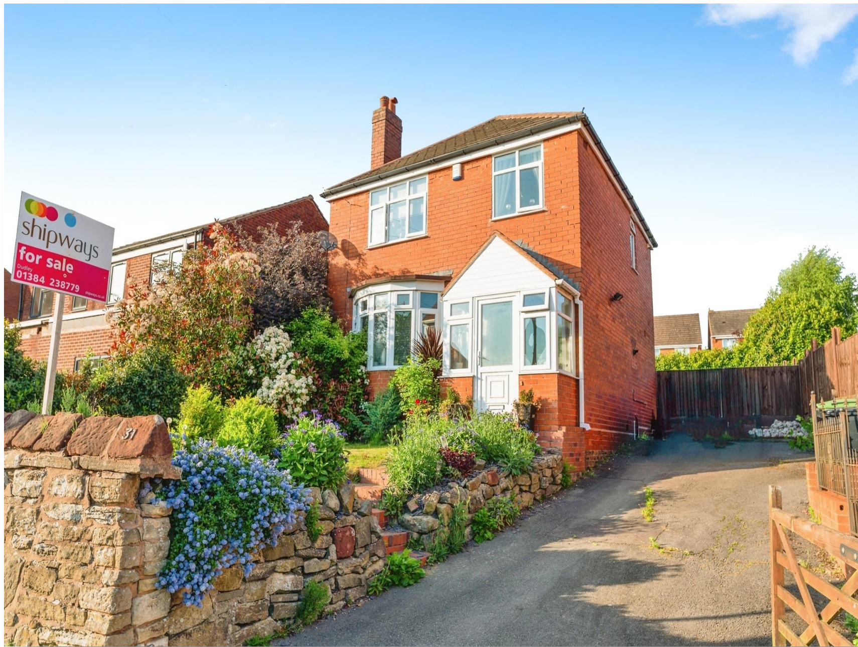
Lake Street, Dudley DY3 2AU