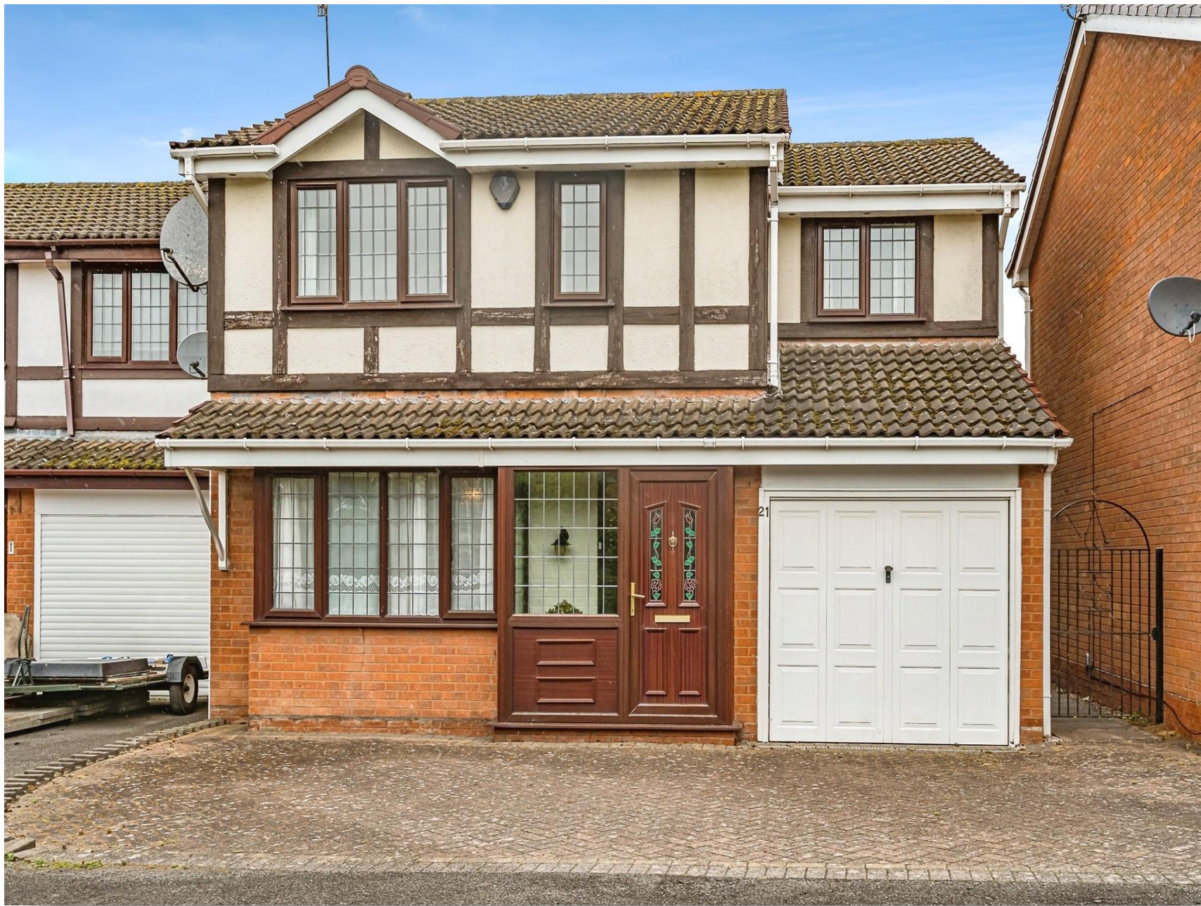
Ashton Park Drive, Brierley Hill DY5 3ER