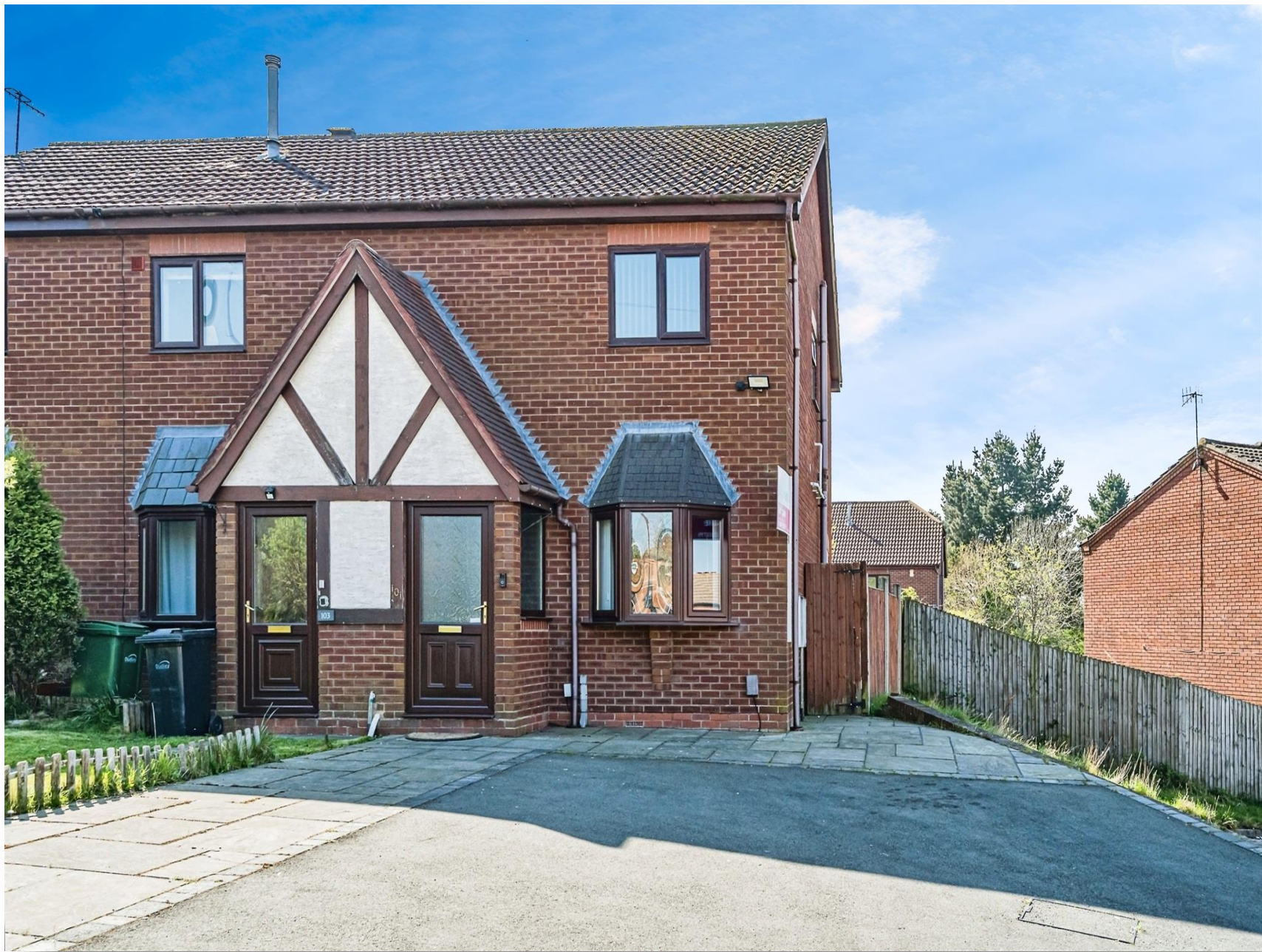
Wealdstone Drive, Dudley DY3 2QR