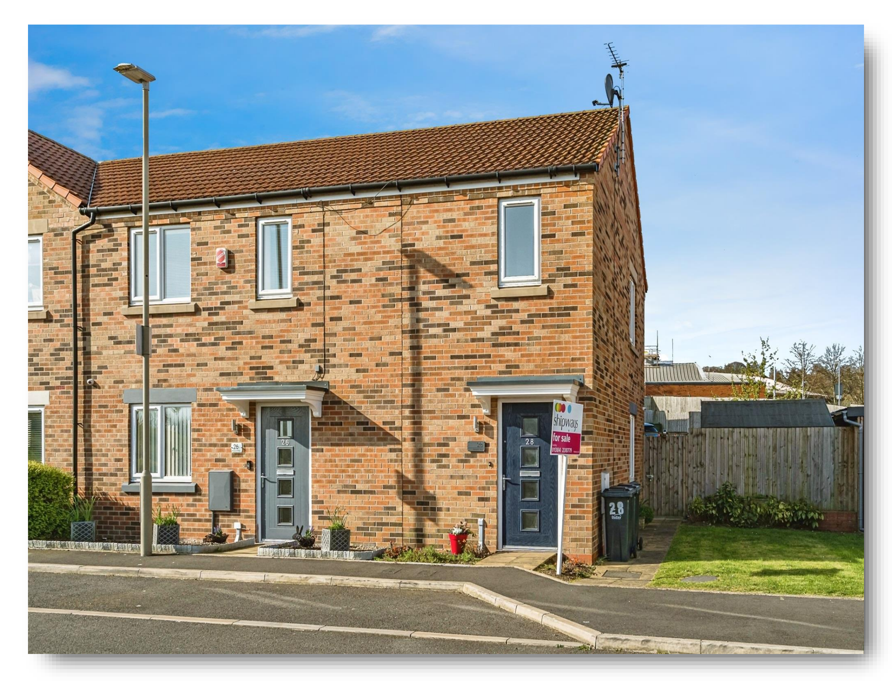
Messiter Way, Dudley, DY1 4SY