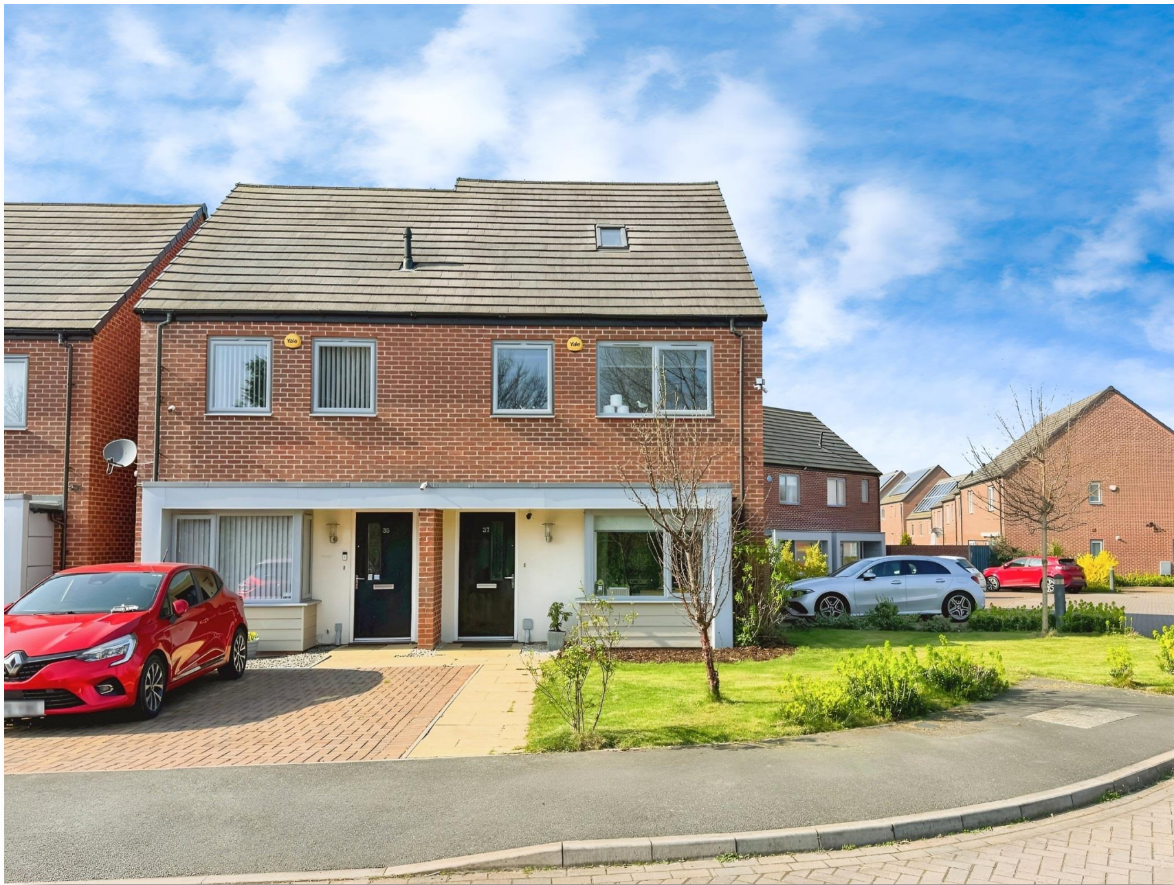
Hatfield Drive, Bilston WV14 0JW