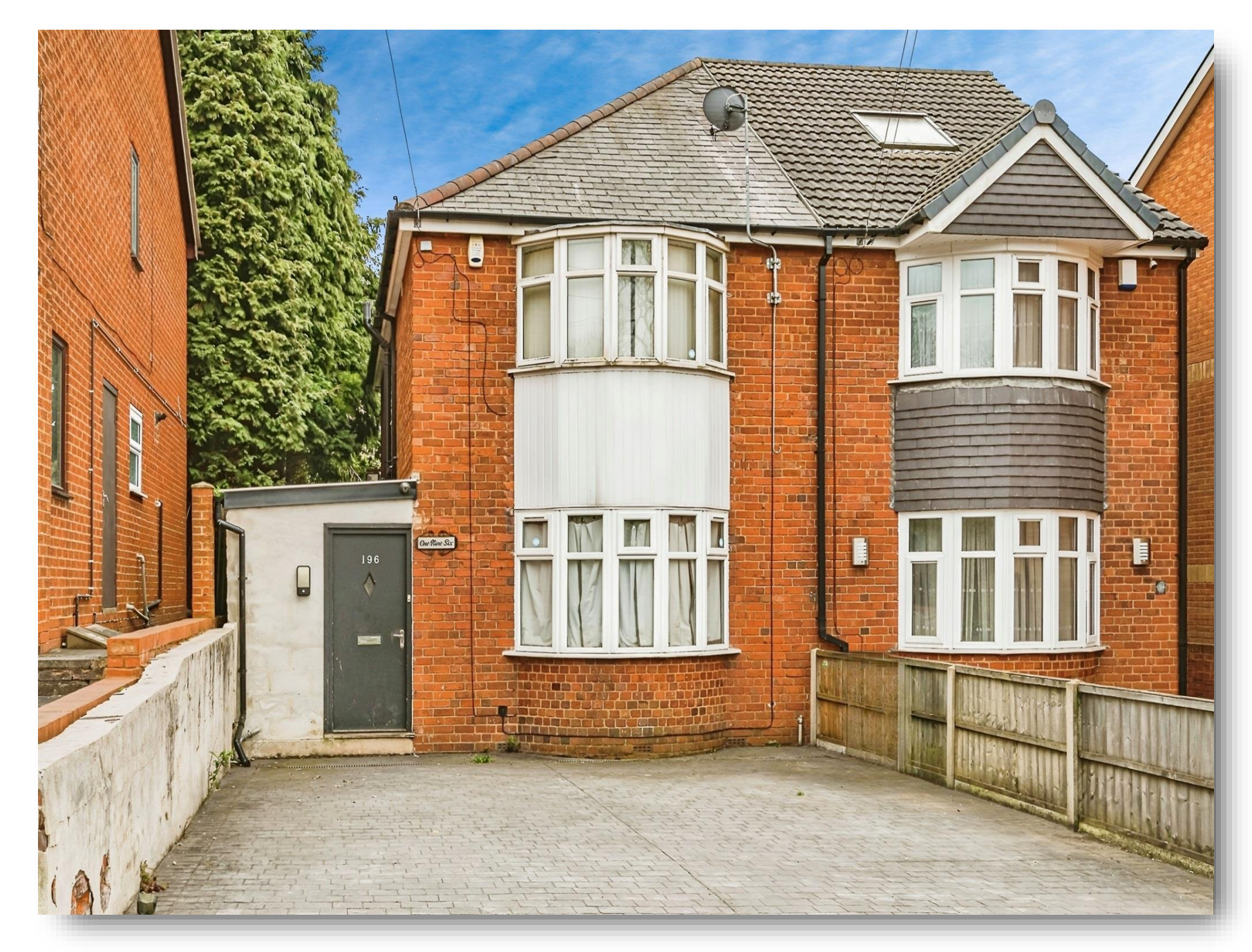
High Street, Pensnett Brierley Hill DY5 4JG