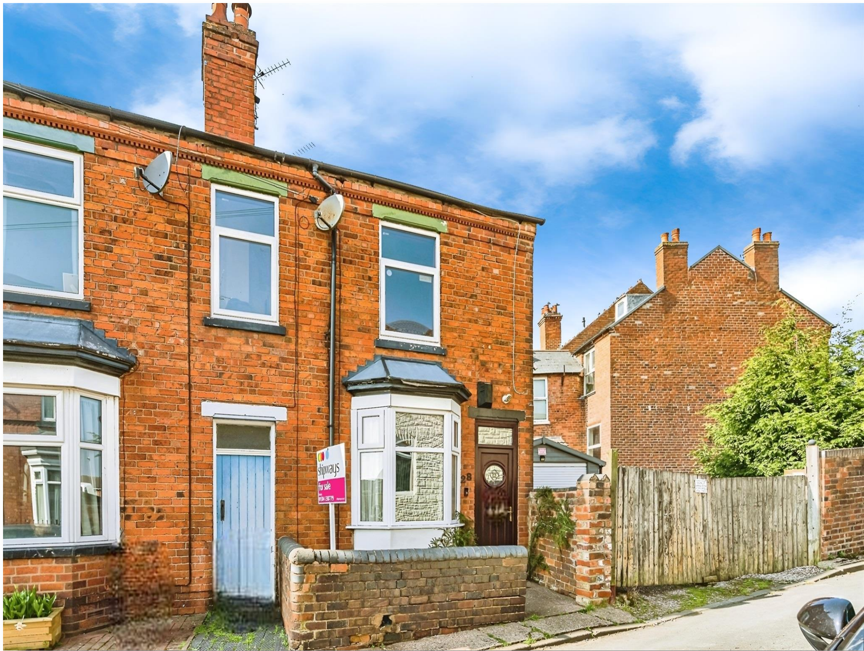
Bell Road, Dudley DY2 0NH