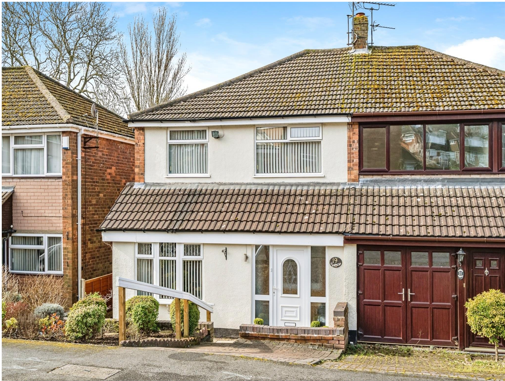
Kew Drive, Dudley, DY1 2QX