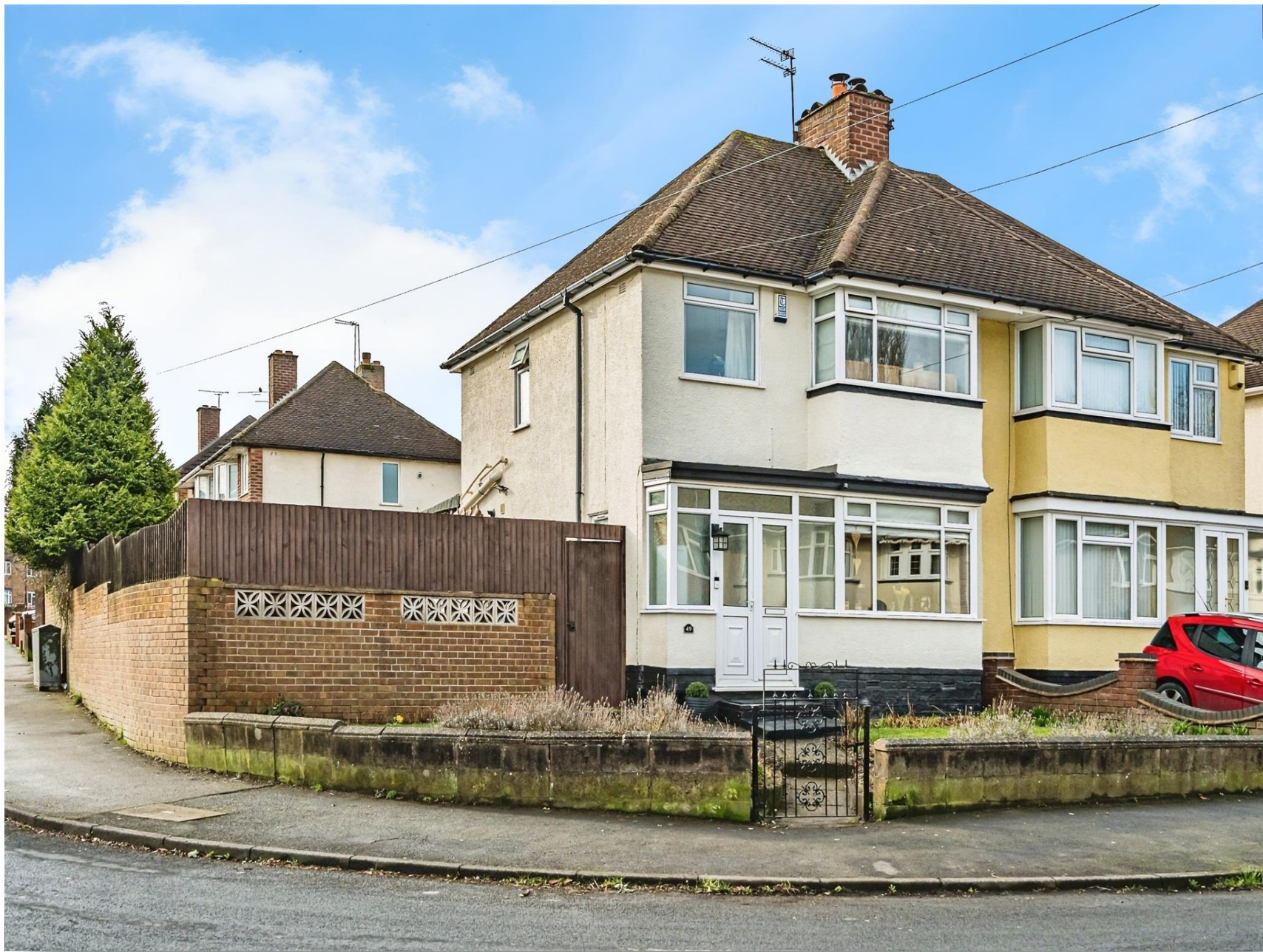
Rosemary Crescent, DUDLEY DY1 3RS