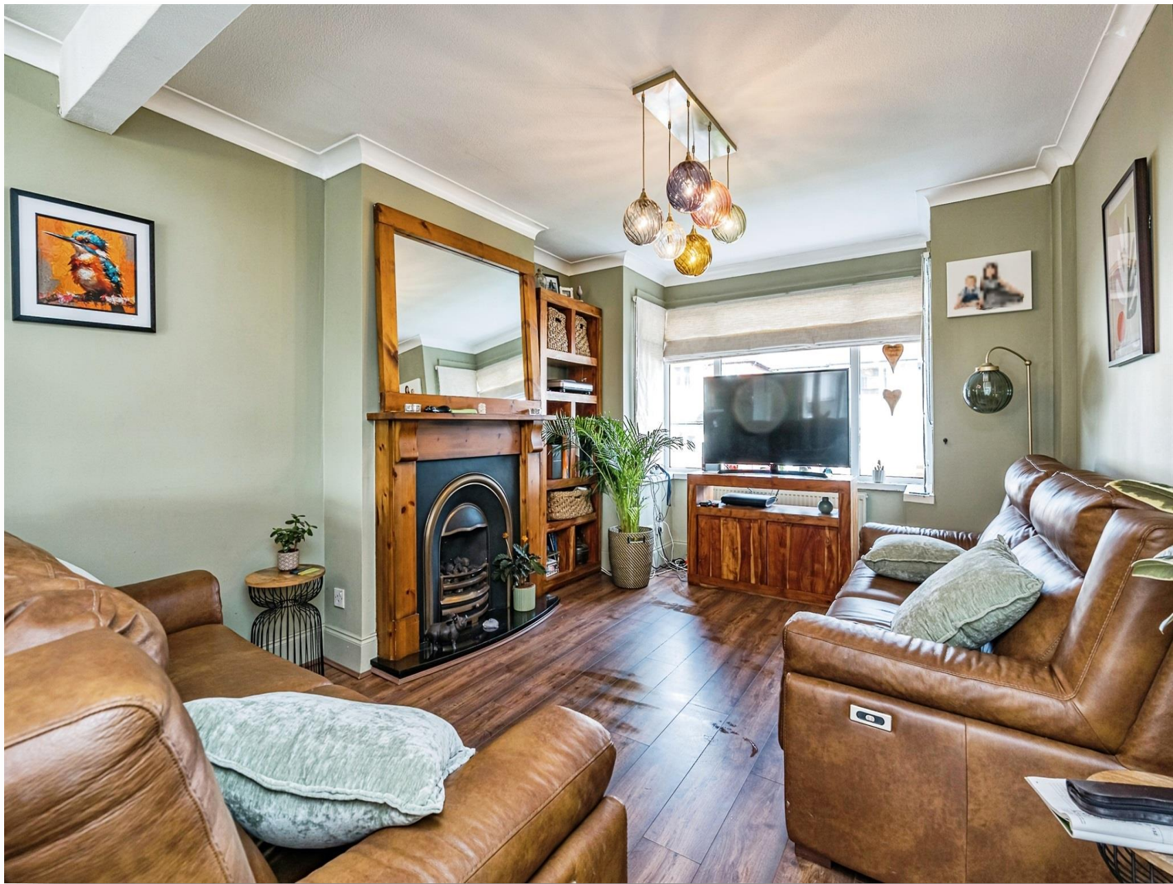
Rosemary Crescent,DUDLEY DY1 3RS