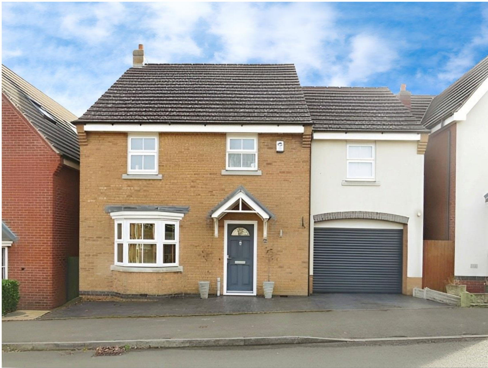
Attingham Drive, Dudley DY1 3HW