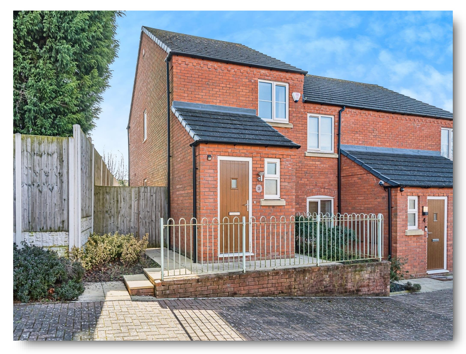
The Lych Gate, Kingswinford DY6 8BG