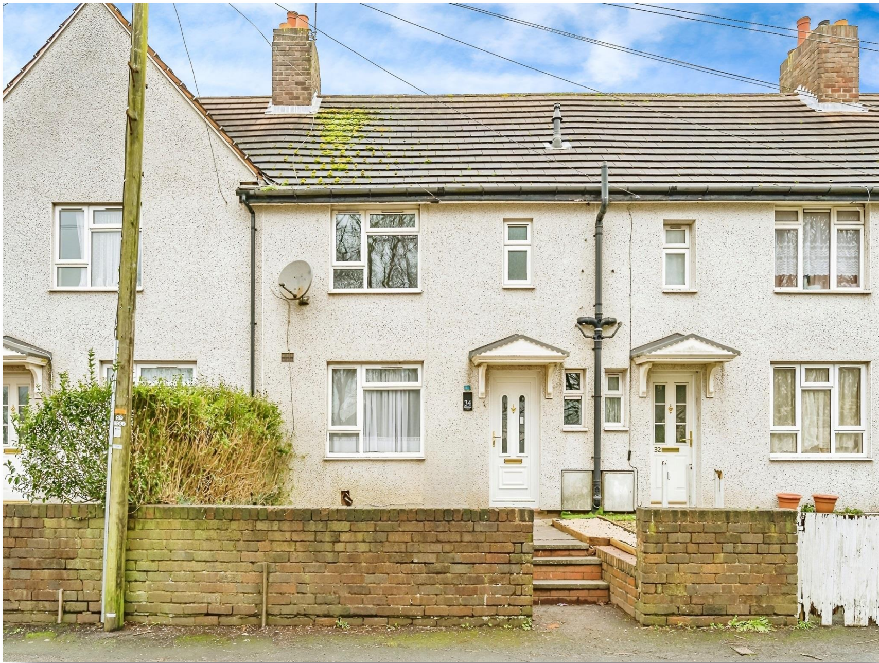
Greystone Street, Dudley DY1 1SH