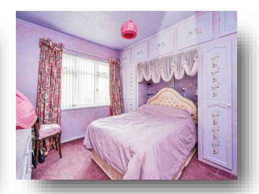
Foxhills Park