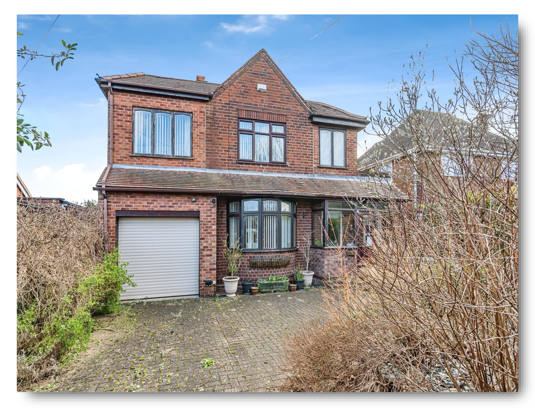
Hockley Lane, Dudley DY2 0JW