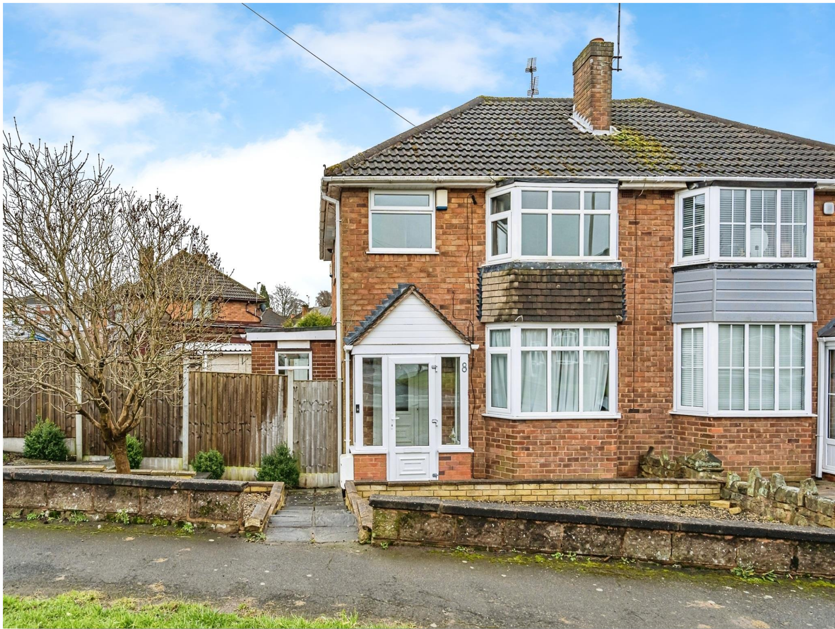
Northway,DUDLEY DY3 3PQ