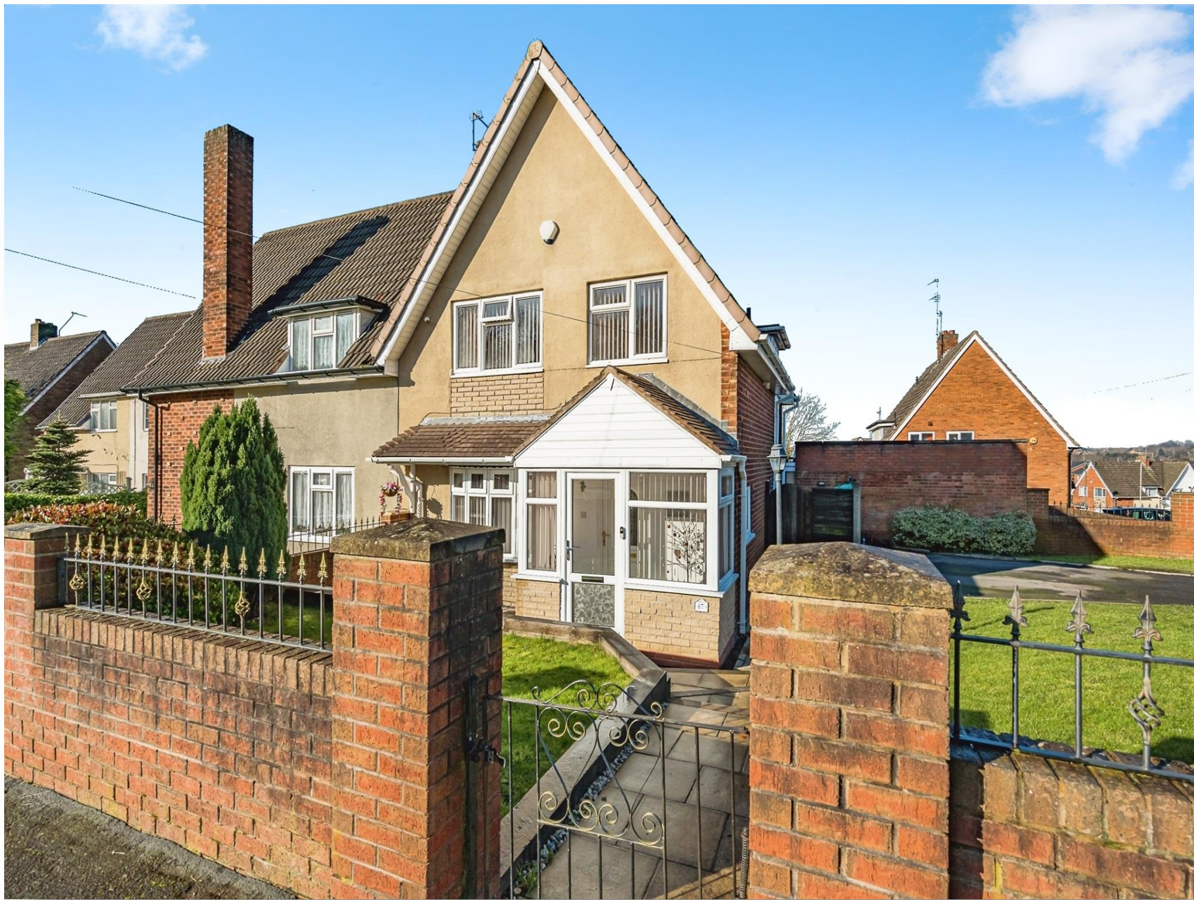
Ashenhurst Road,Dudley DY1 2HN