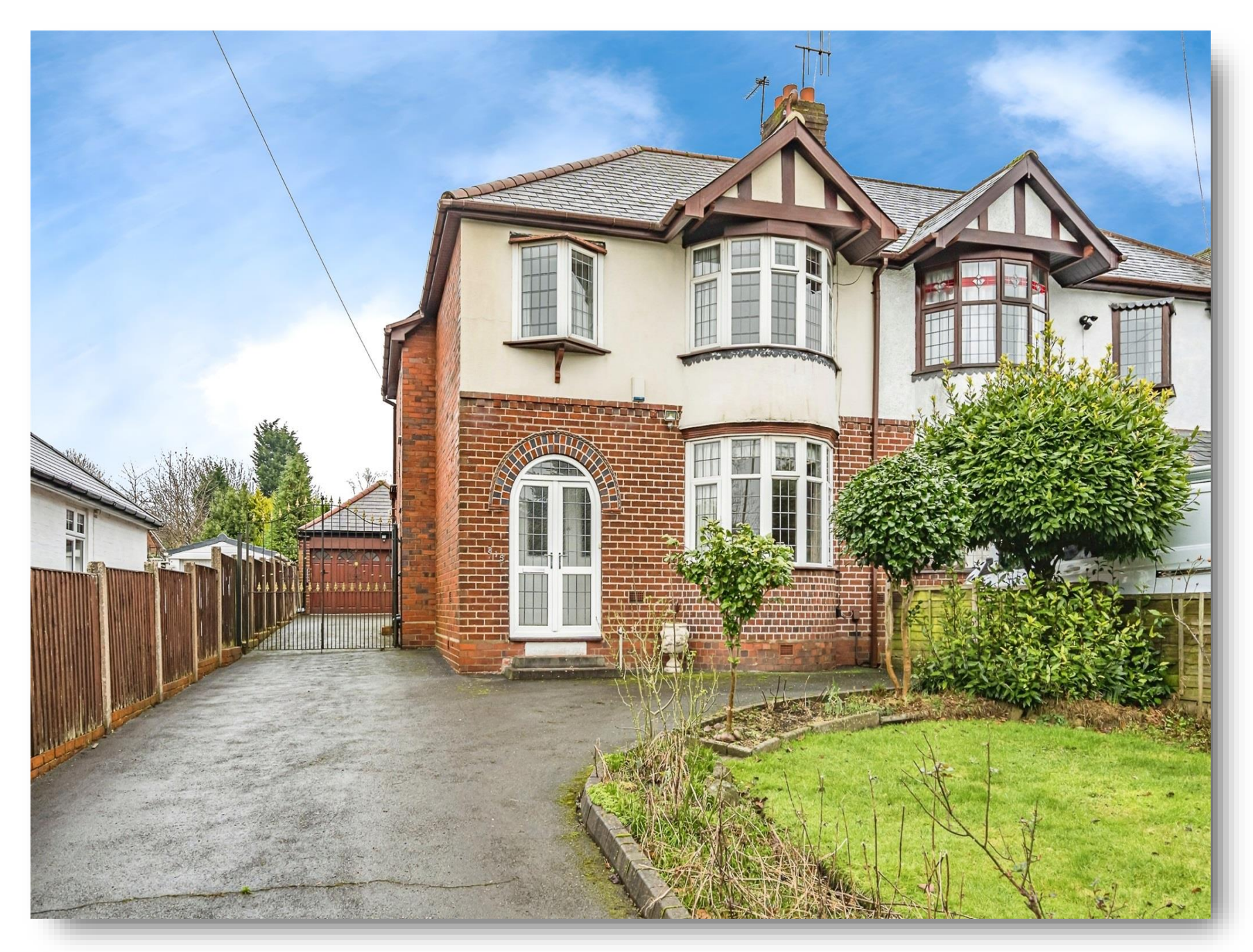
Birmingham New Road, Dudley, DY4 8AS