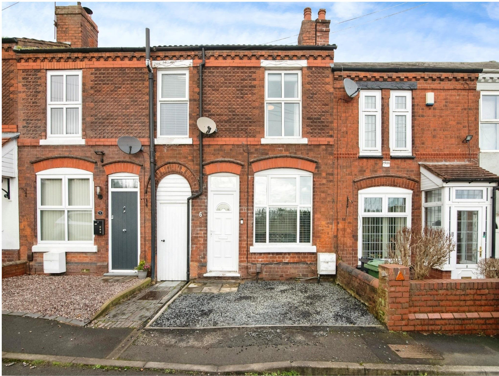
Rock Road, Bilston WV14 9HA