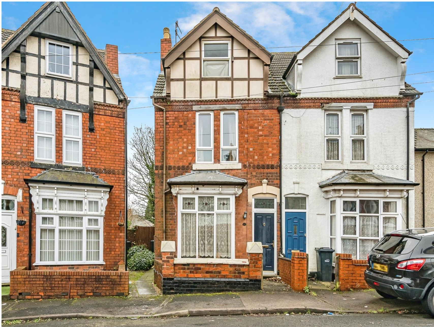
Gamage Street, Dudley DY2 8XL