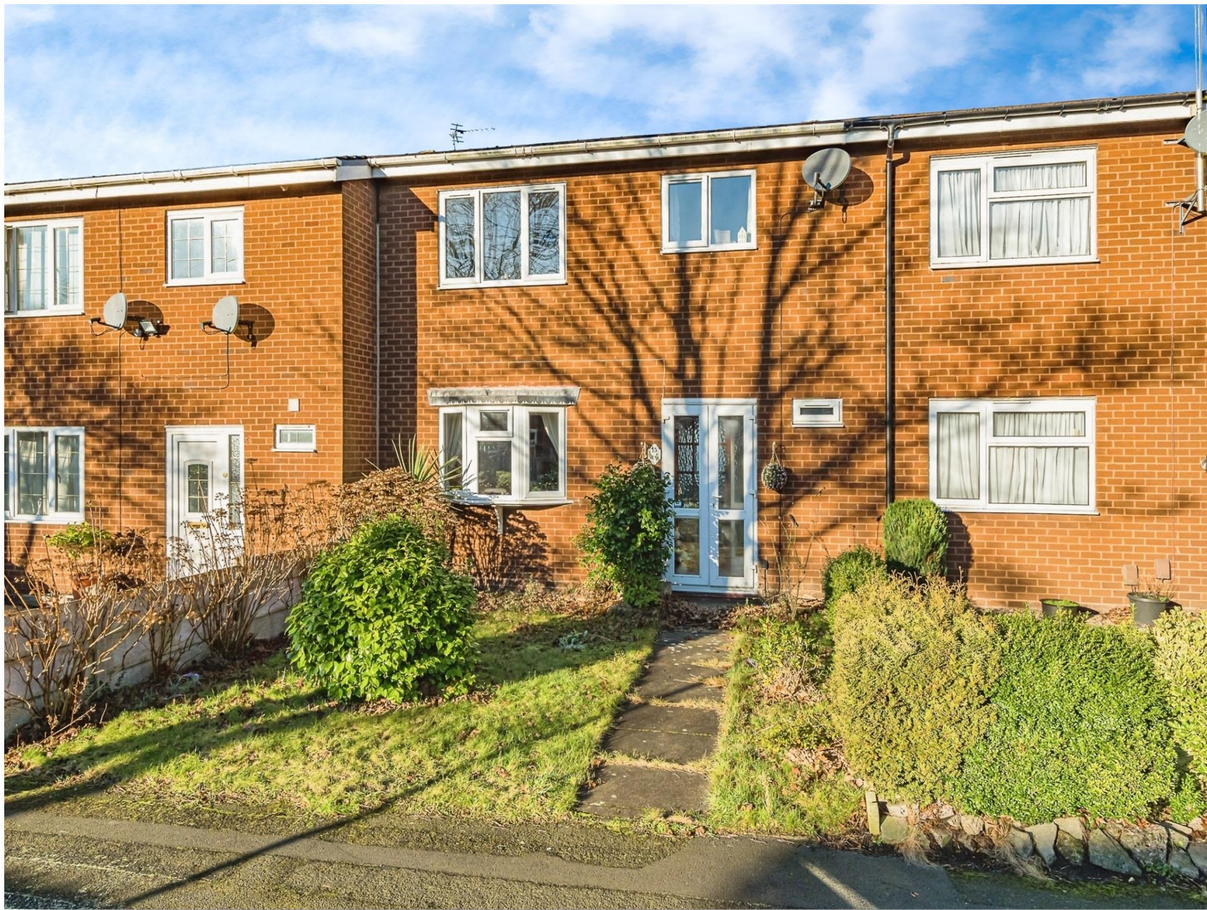
Keir Hardie Walk, Tividale, OLDBURY B69 3LN