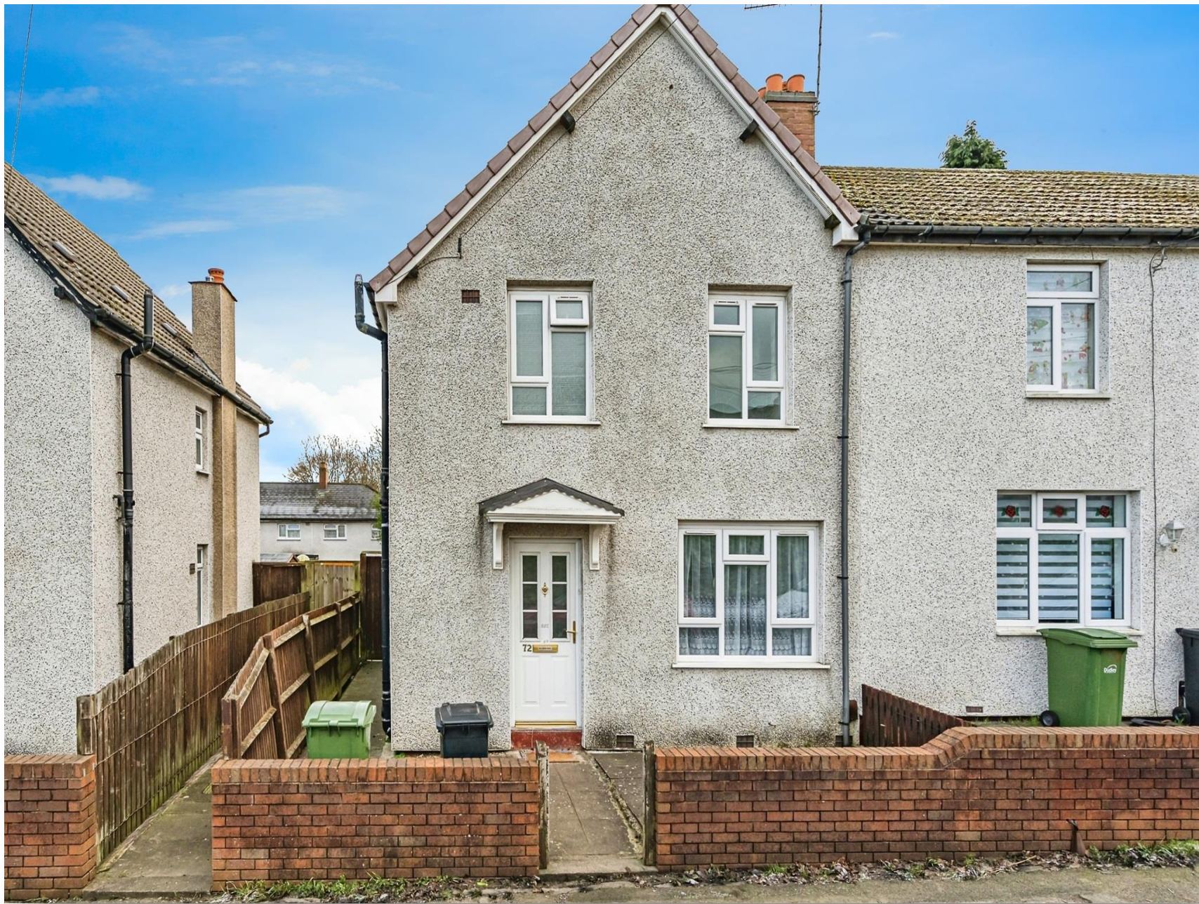
Bunns Lane,Dudley DY2 7RE