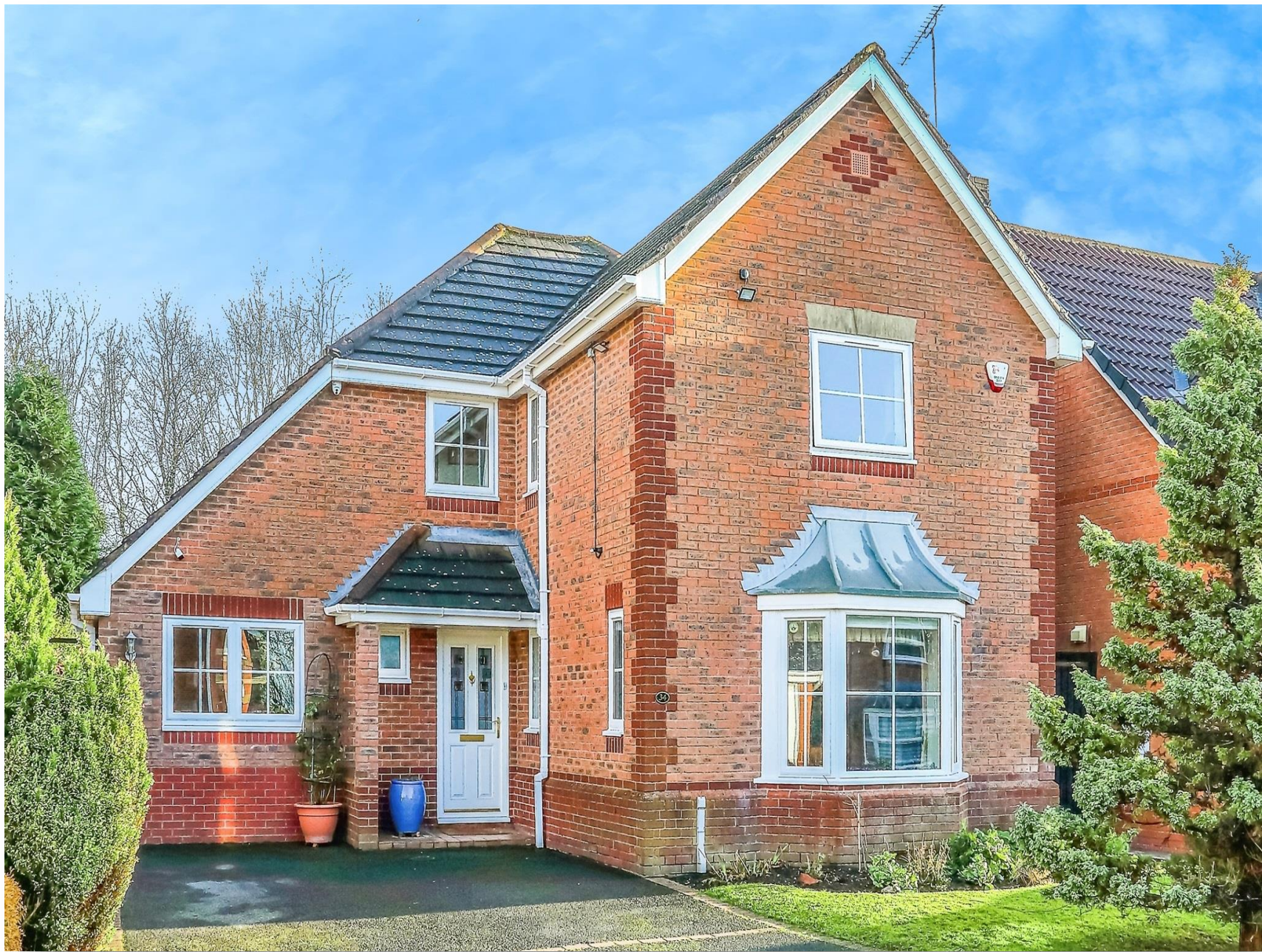
Kinloch Drive, DUDLEY, DY1 3DB