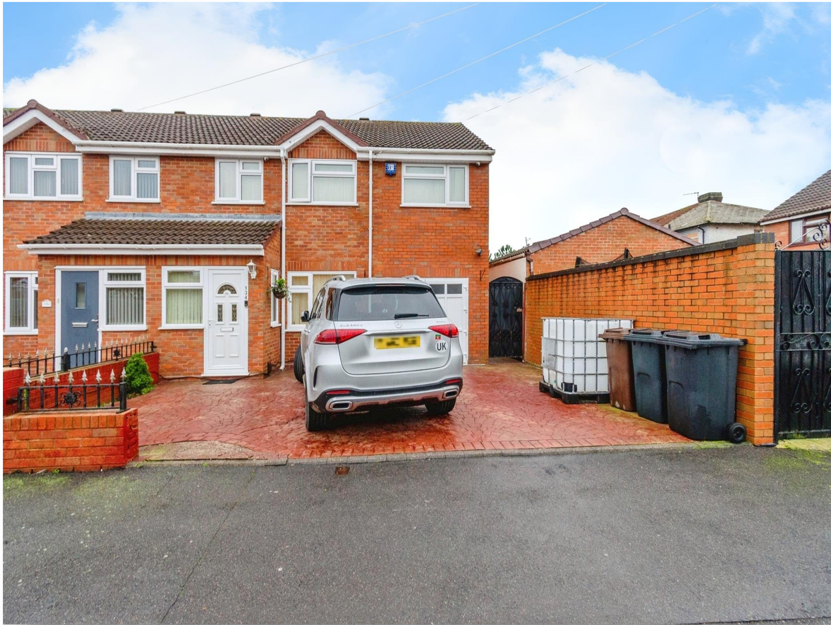
Silverton Way, WOLVERHAMPTON WV11 3LA