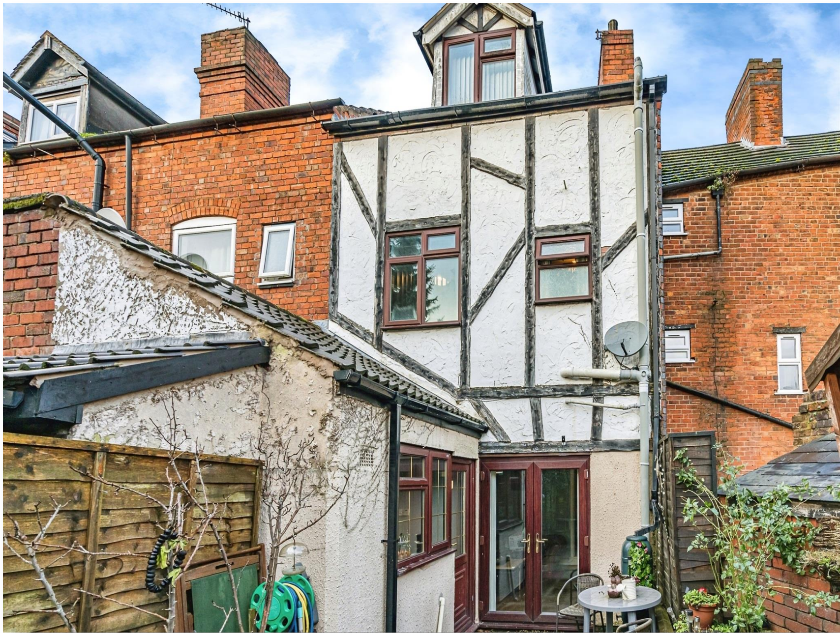
1a Southalls Lane, DUDLEY DY1 1UL