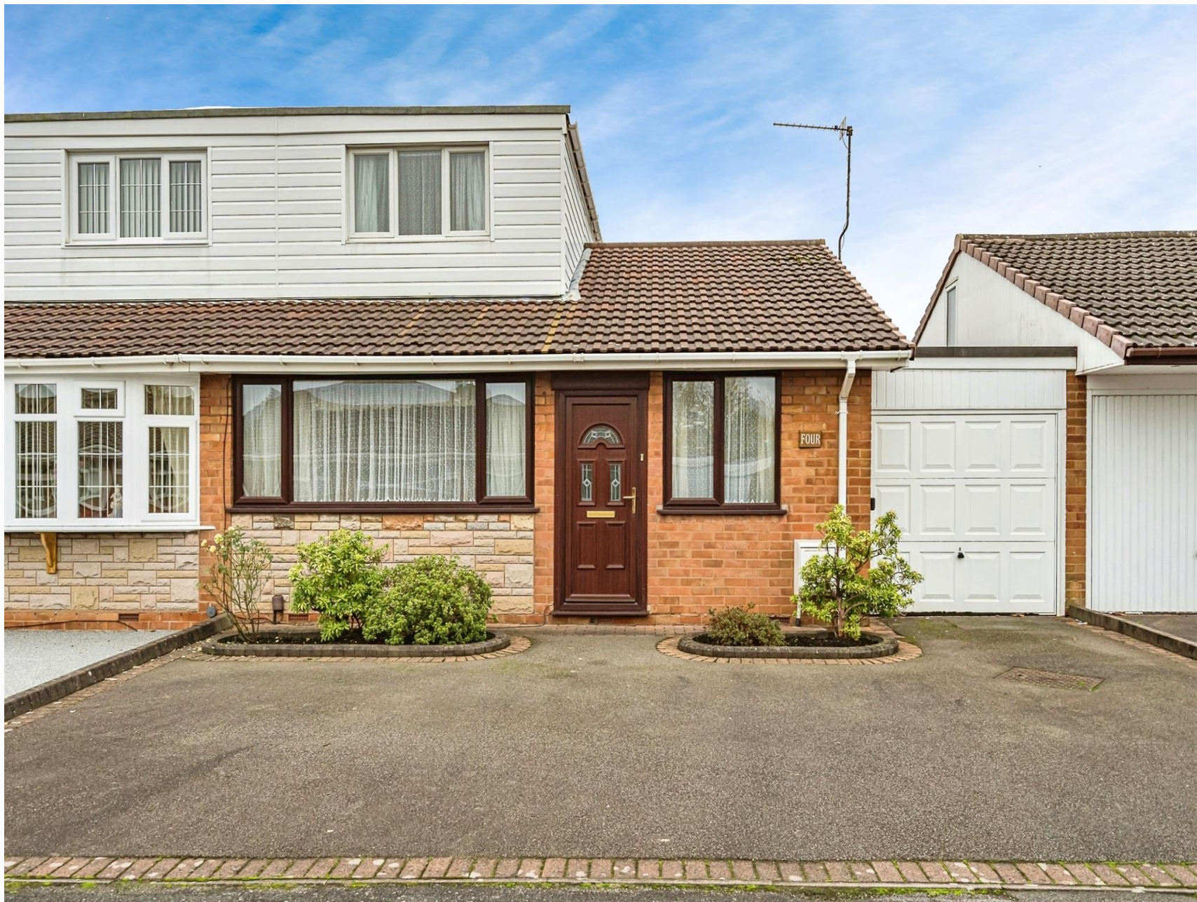
Rachel Close, Tipton DY4 0EJ