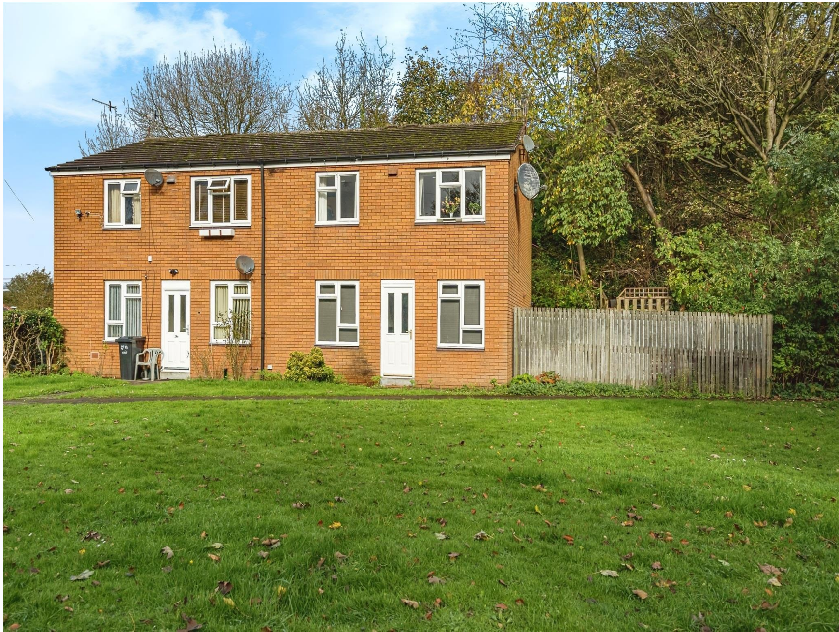
Bennetts Hill, Dudley DY2 7EW