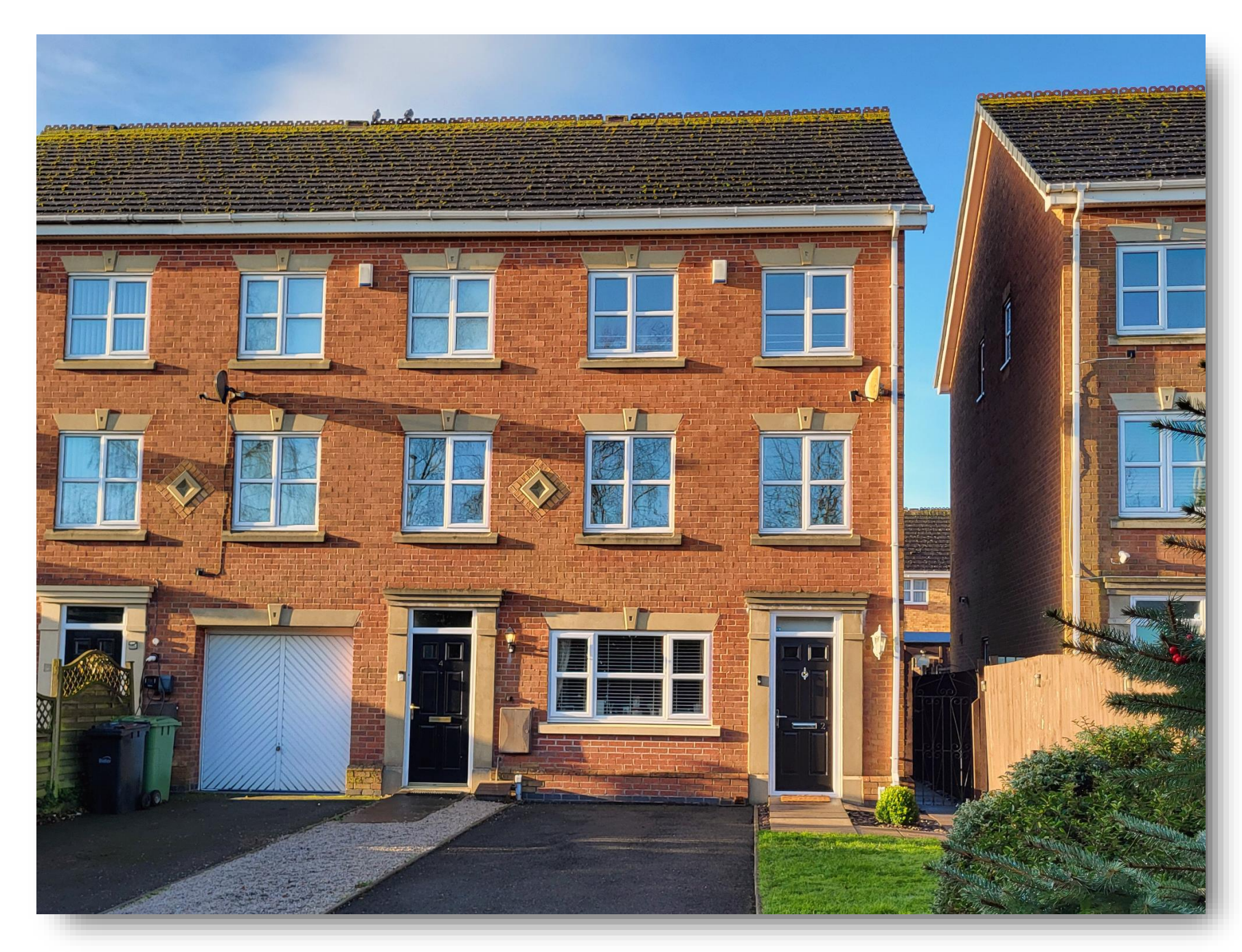
The Shrubbery, Dudley, DY1 2BZ