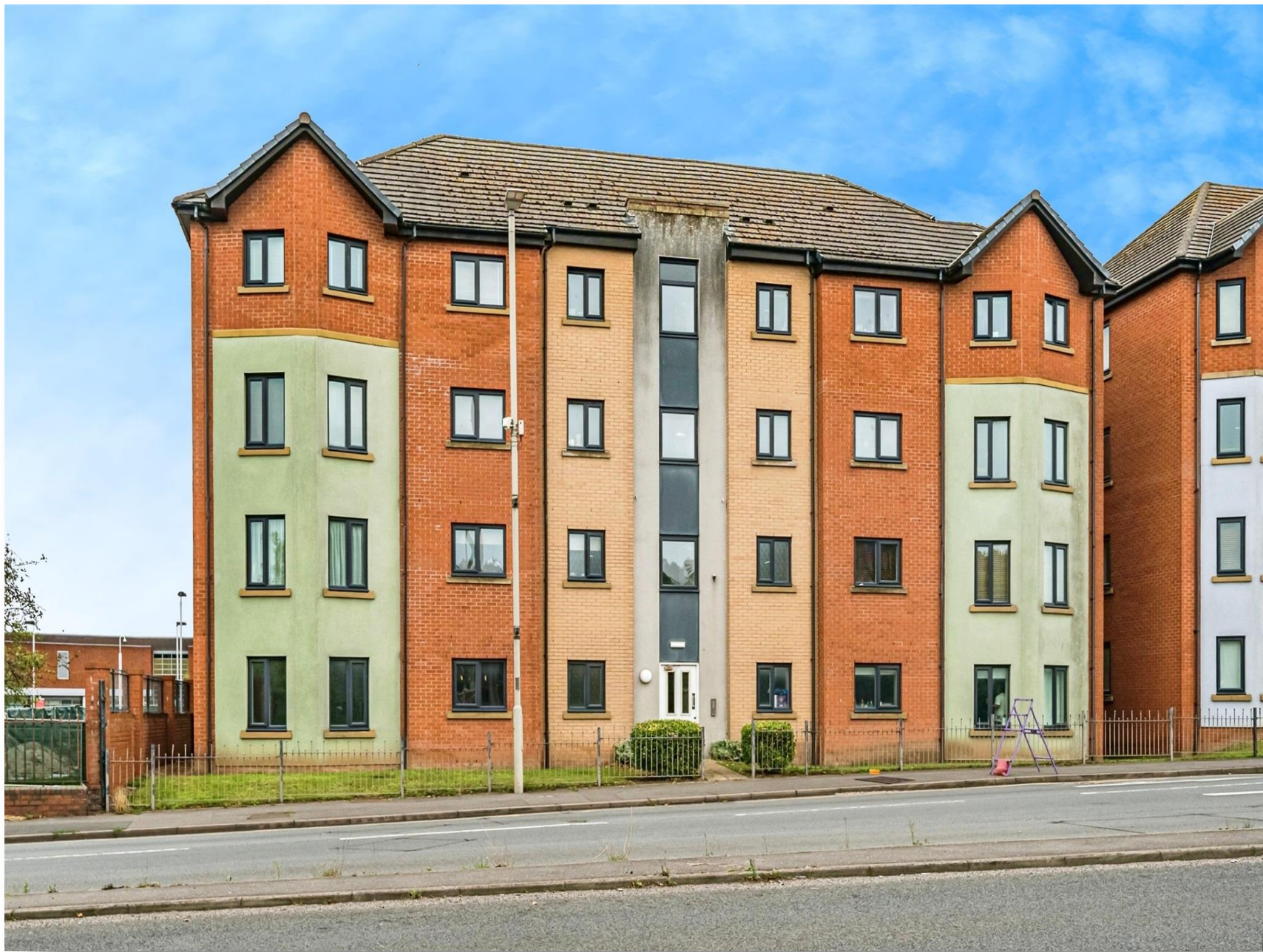
Page's Croft, DUDLEY DY1 4AE