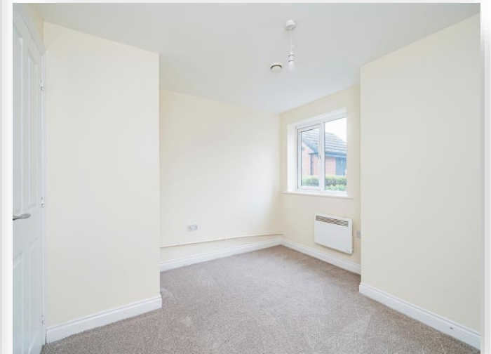
Page's Croft, DUDLEY DY1 4AE