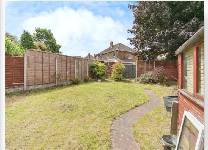
Birmingham New Road, Bilston WV14 9PR