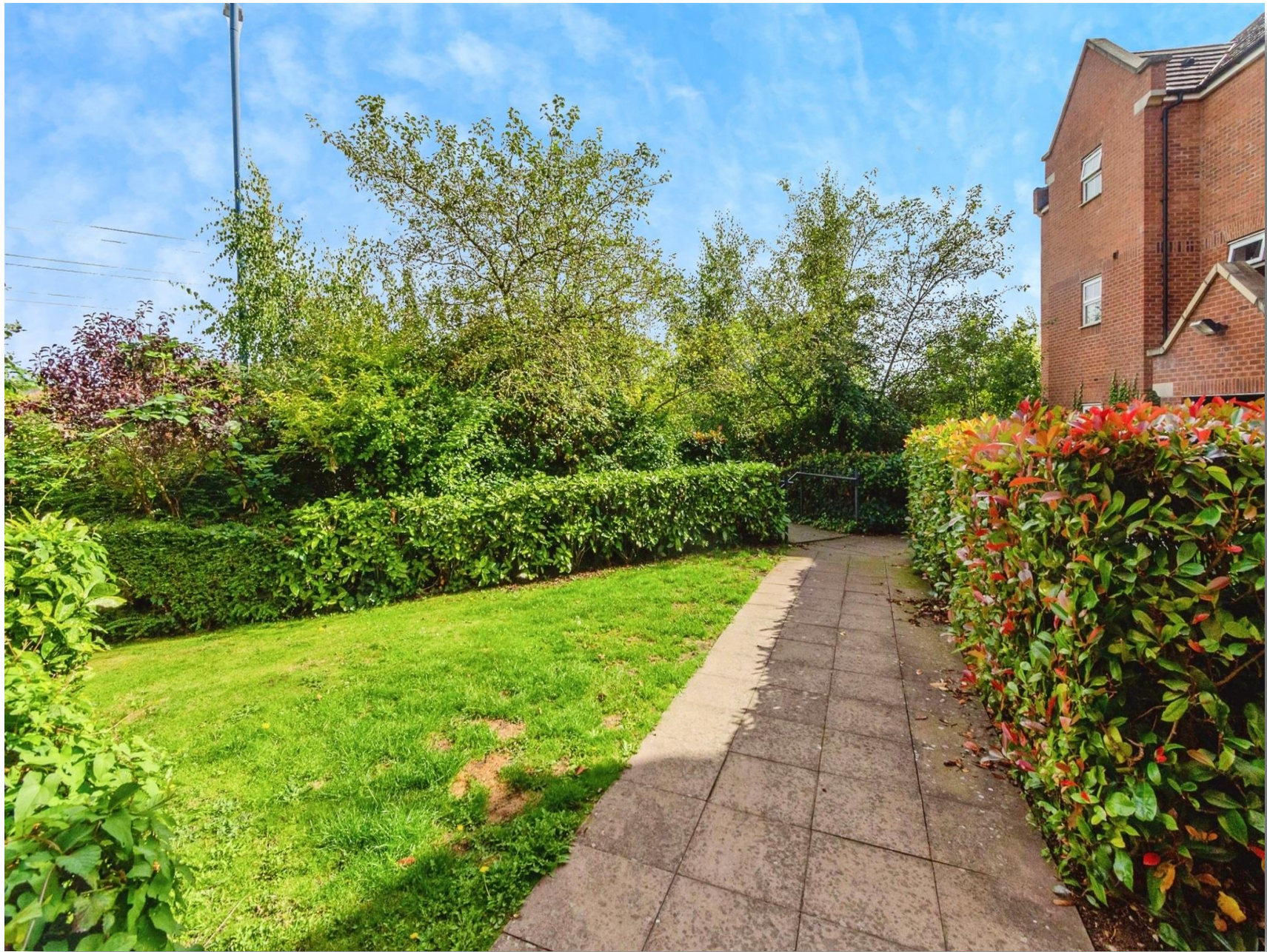
Jonah Drive, Tipton DY4 7AP