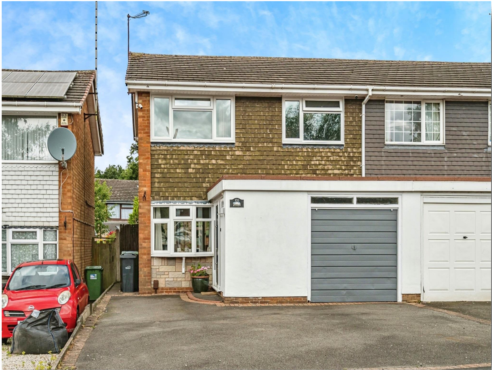
Northway, DUDLEY, DY3 3RE