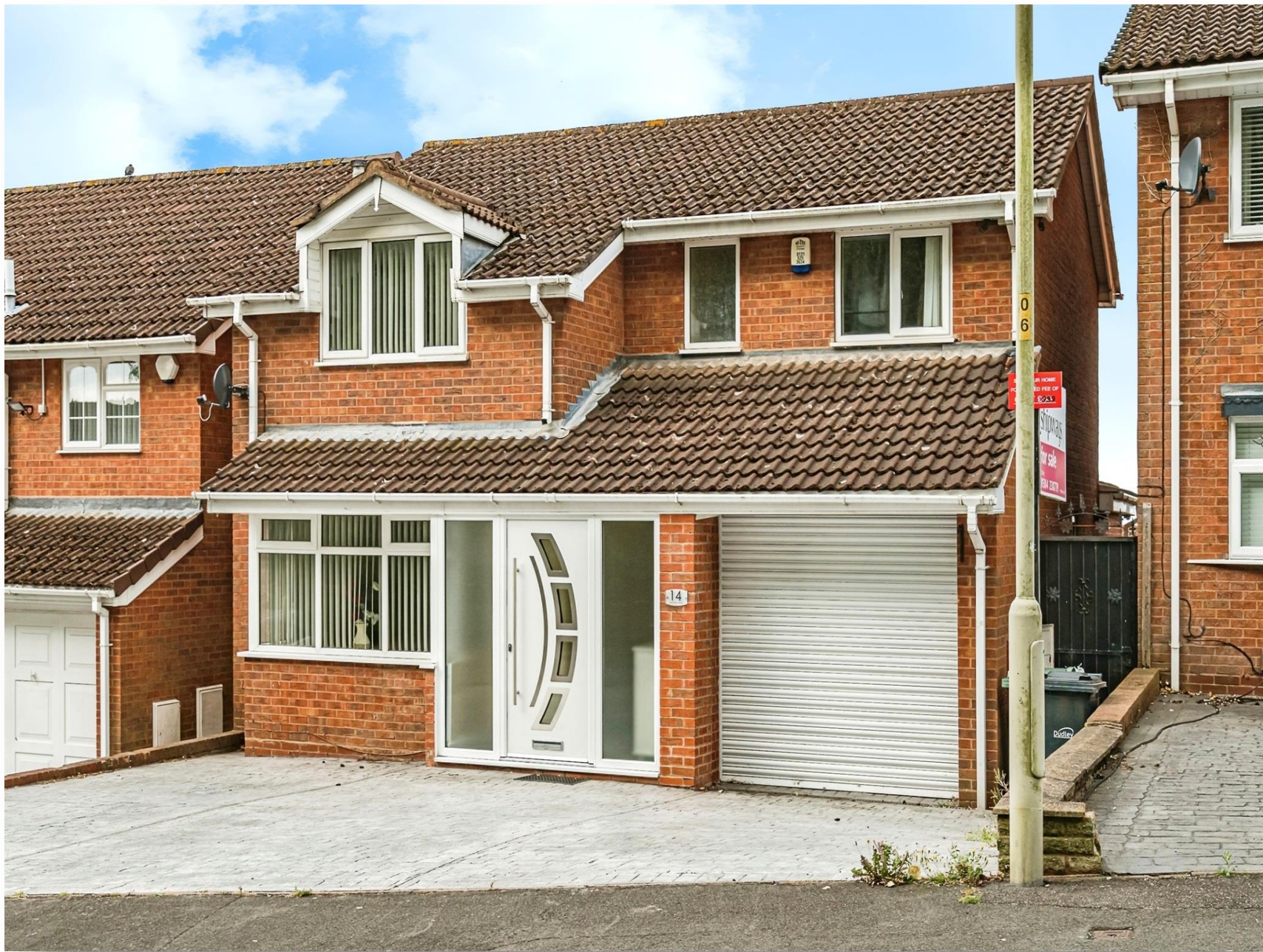
Aintree Way, Dudley, DY1 2SL