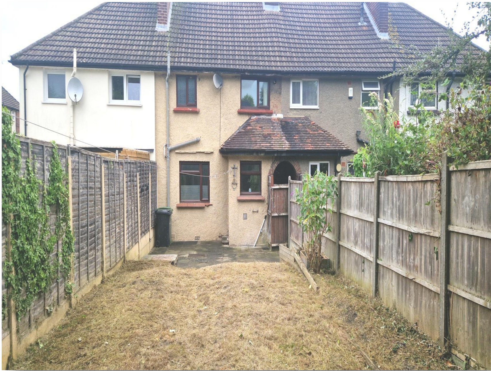
Oak Road, Dudley DY1 4BQ