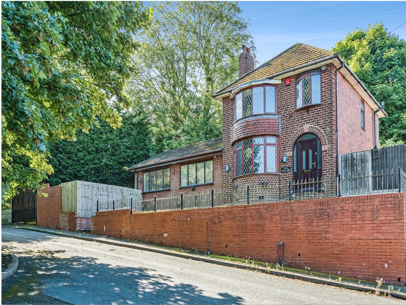
East Street, Dudley DY2 7HG