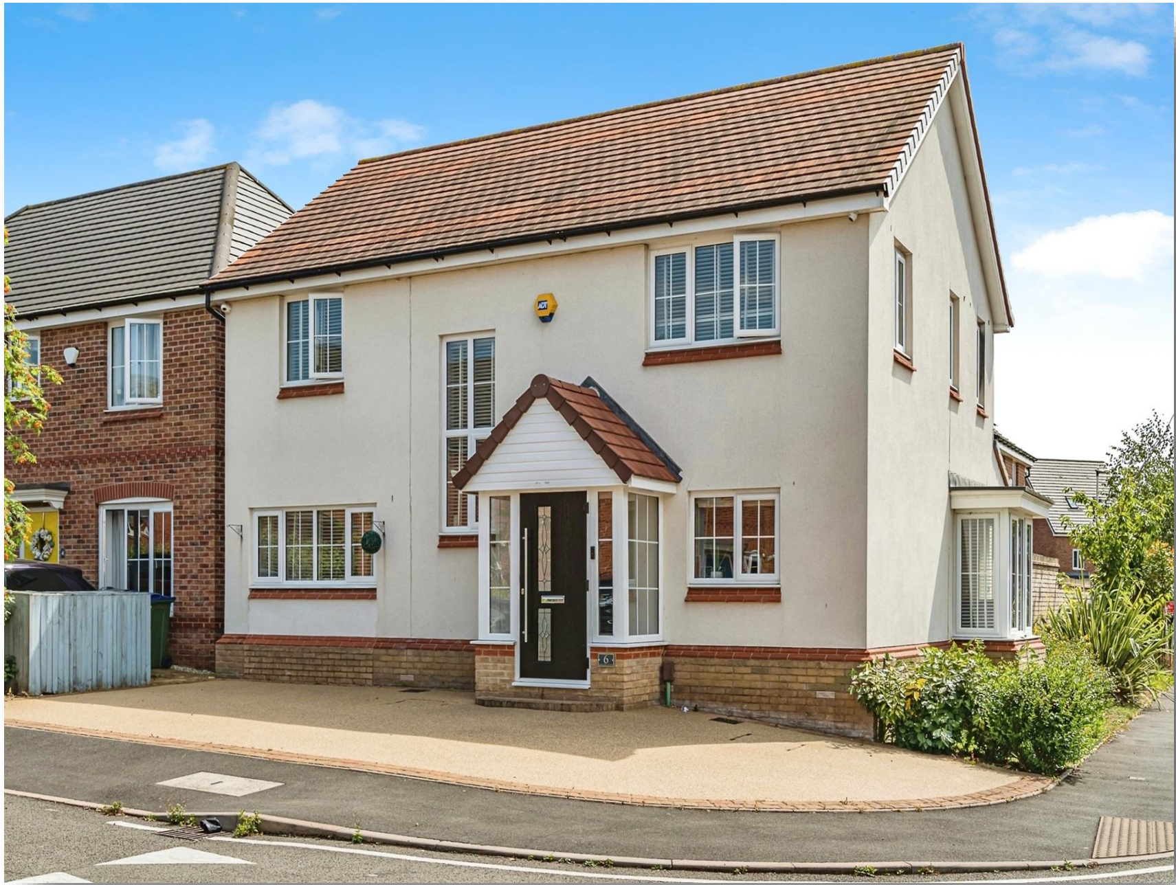
Minton Drive, Cradley Heath B64 5RL