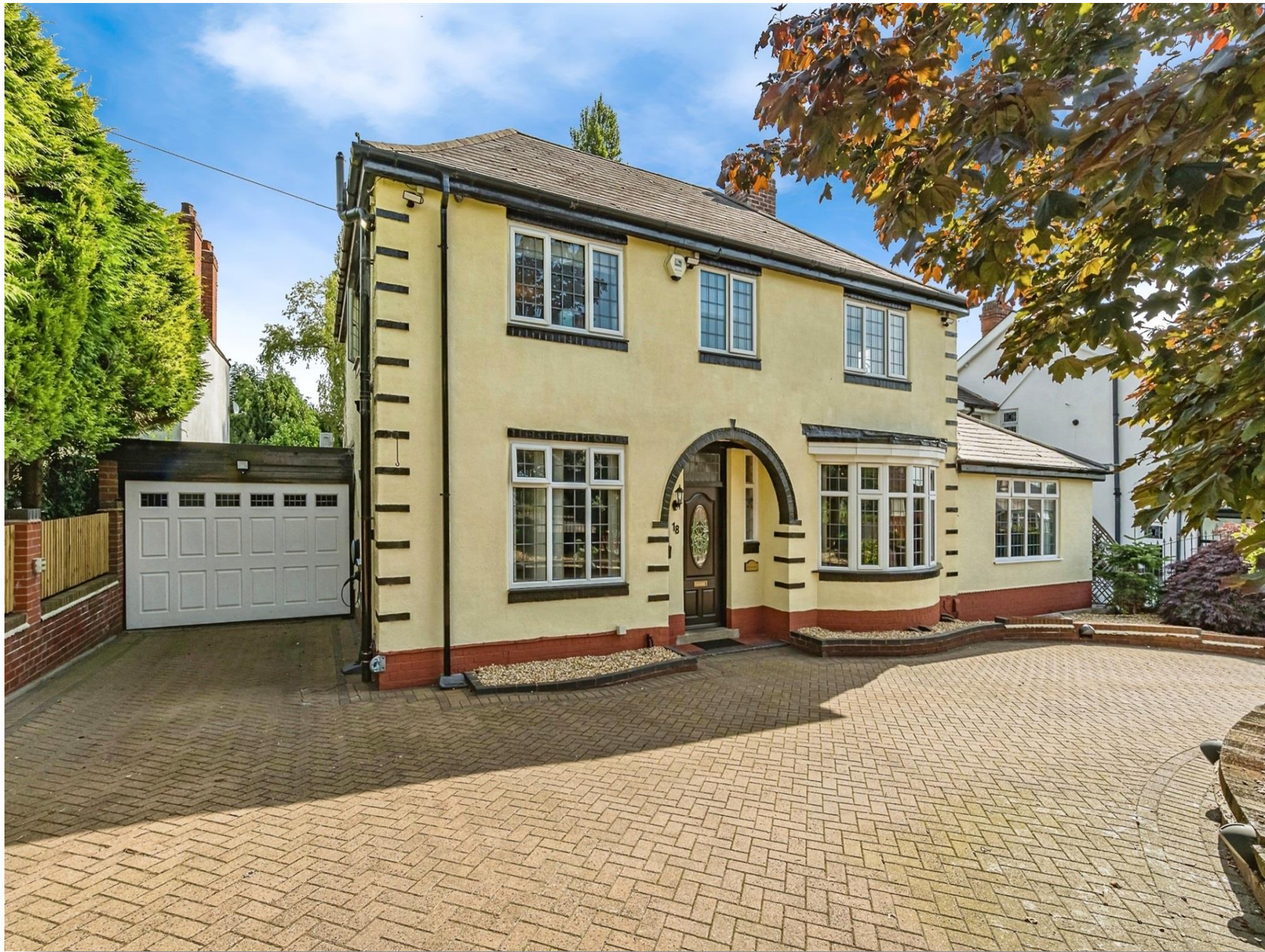
Tansley Hill Road, Dudley DY2 7ER