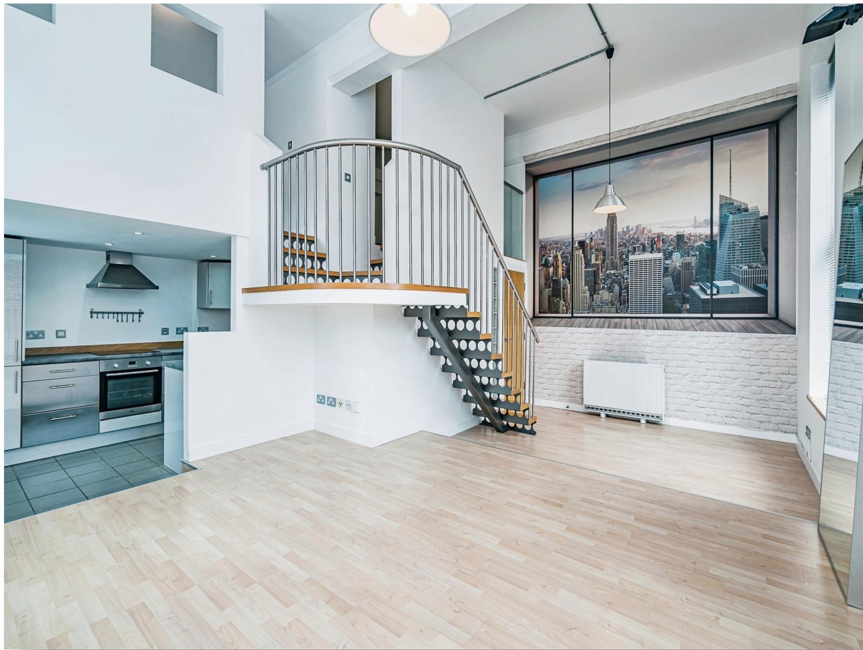
Parsons Street Metropolitan Lofts, Dudley DY1 1JE