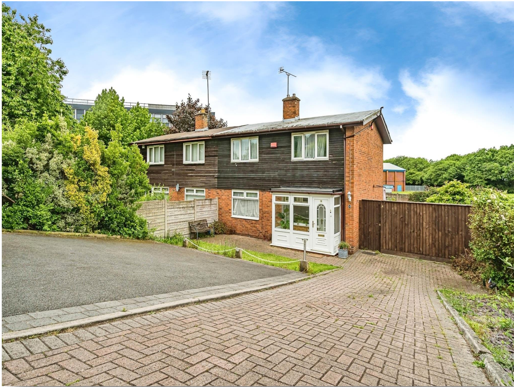
Scotts Green Close, Dudley DY1 2DU