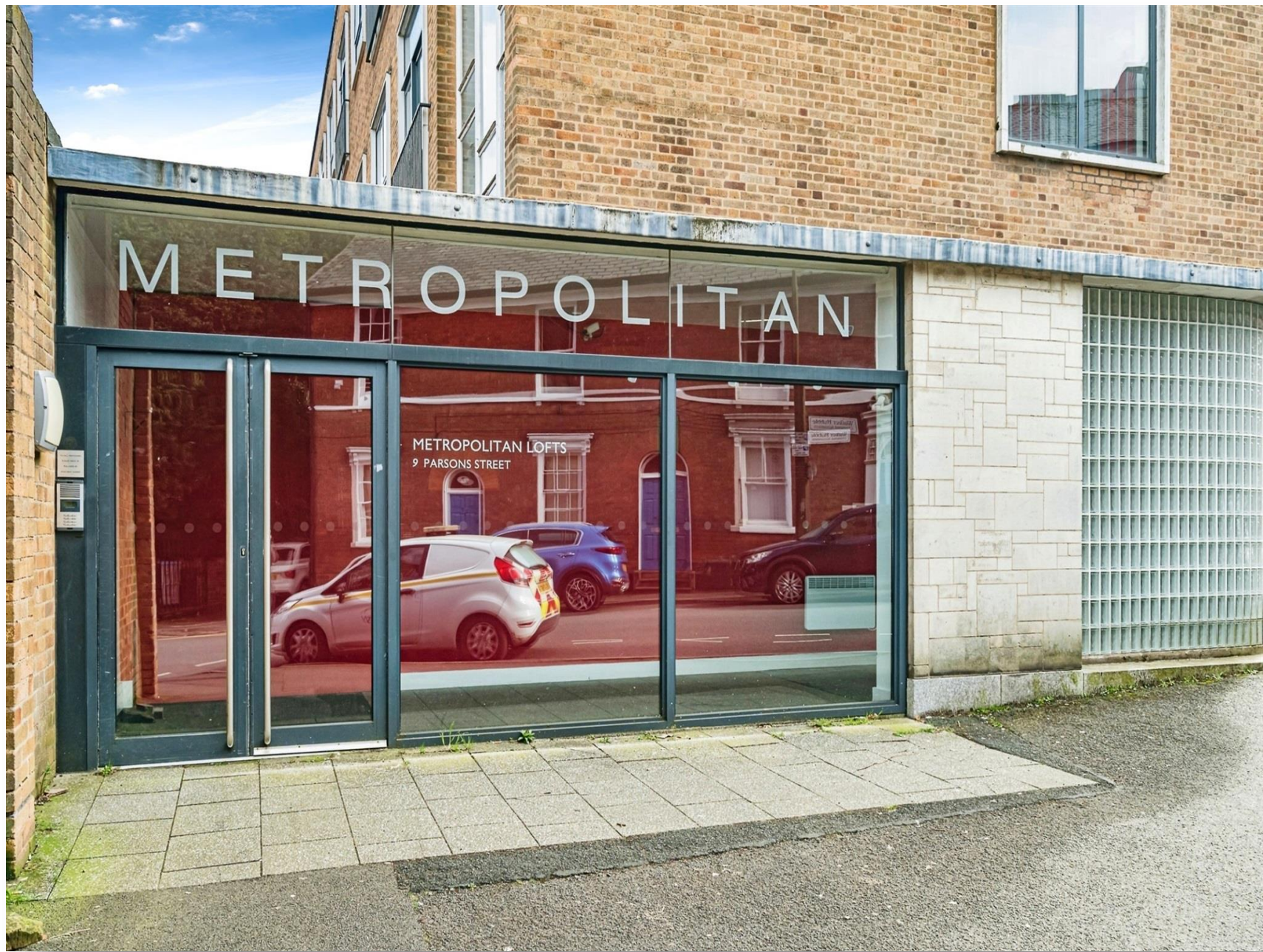
Metropolitan Lofts Parsons Street, Dudley, DY1 1JE