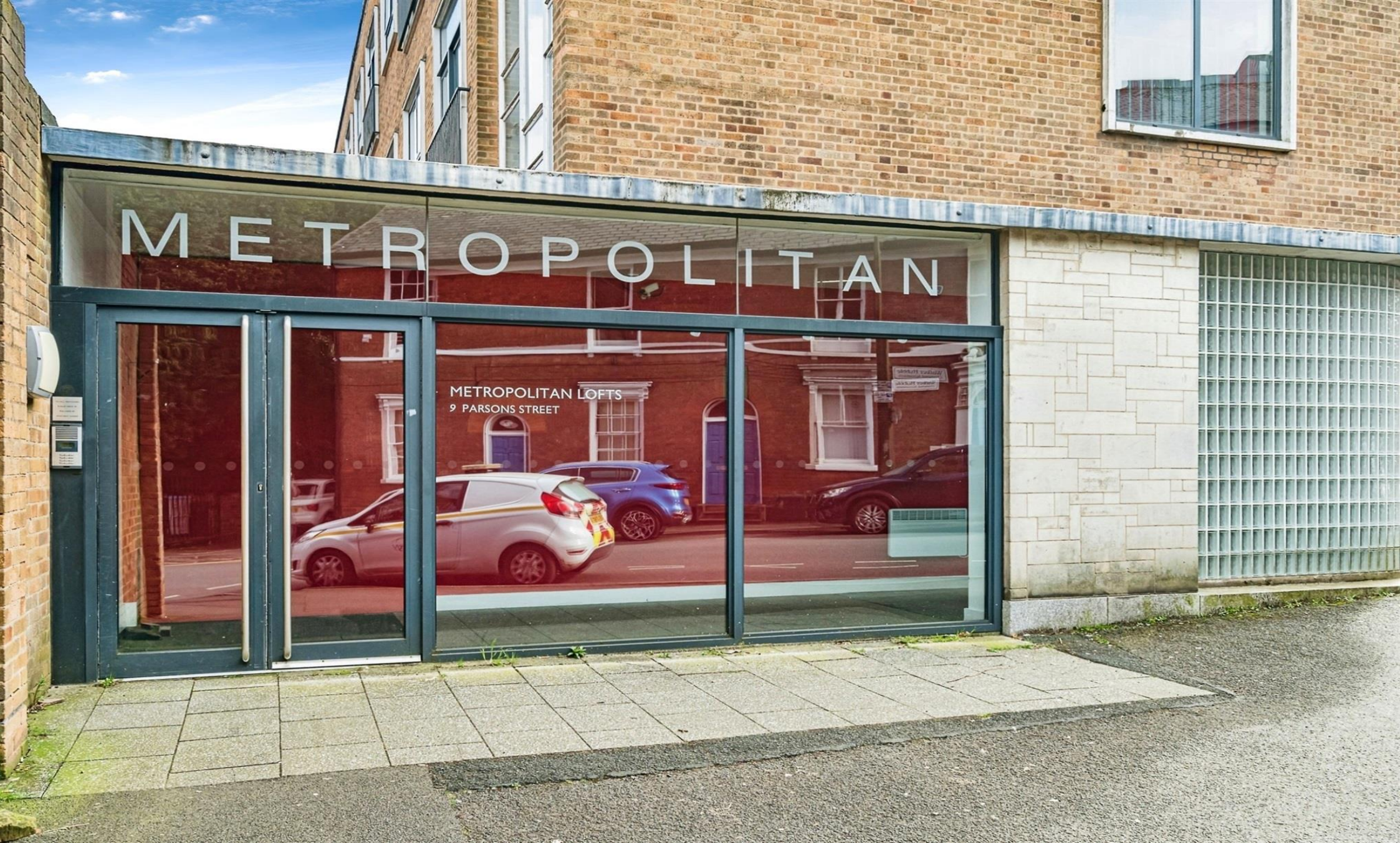
Metropolitan Lofts Parsons Street, Dudley DY1 1JE